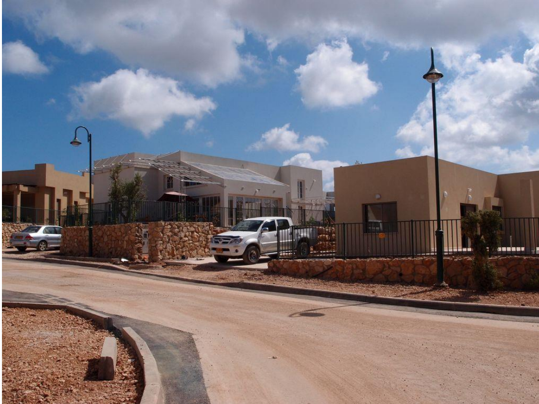
New residential area according to development plans in an era of privatization. Kibbutz Hanita 2012.

(irreversible) structural evolution, their residents receiving the keys to their purchased 4 already demarcated and fenced lot. Common spaces are reduced to a minimum in these neighborhoods.