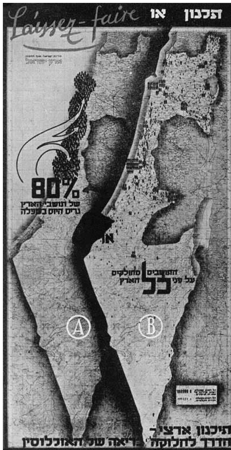
Poster in the exhibition on urban planning, Arieh Sharon (Department of Planning), Museum of Tel Aviv (1950)