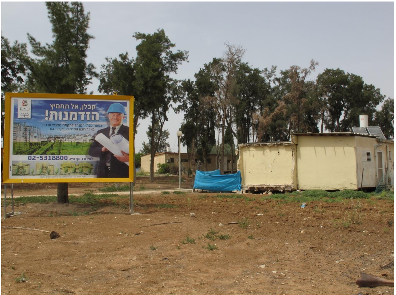
On the left, a poster showing the ambitions of the municipality, on the right, the old ma'abarot doomed to political neglect. (Copyright: Yoann Morvan).