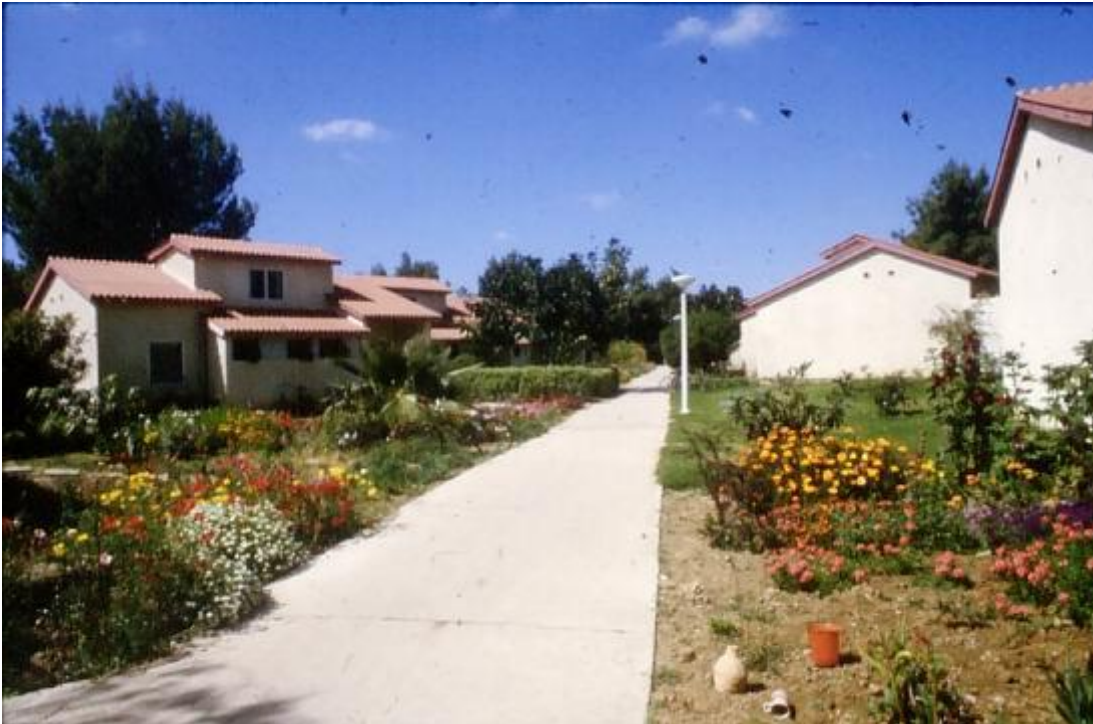
Kiboutz Nahal Oz: Residential area according to the conventional planning with gardens and walkways in an open space.