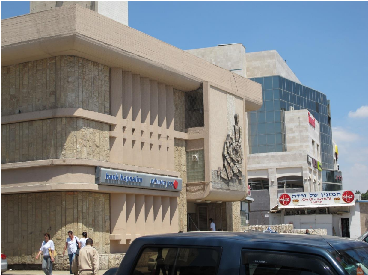
Former town hall transformed into a bank, in the background, the shopping center that houses the new town hall on the top floor.