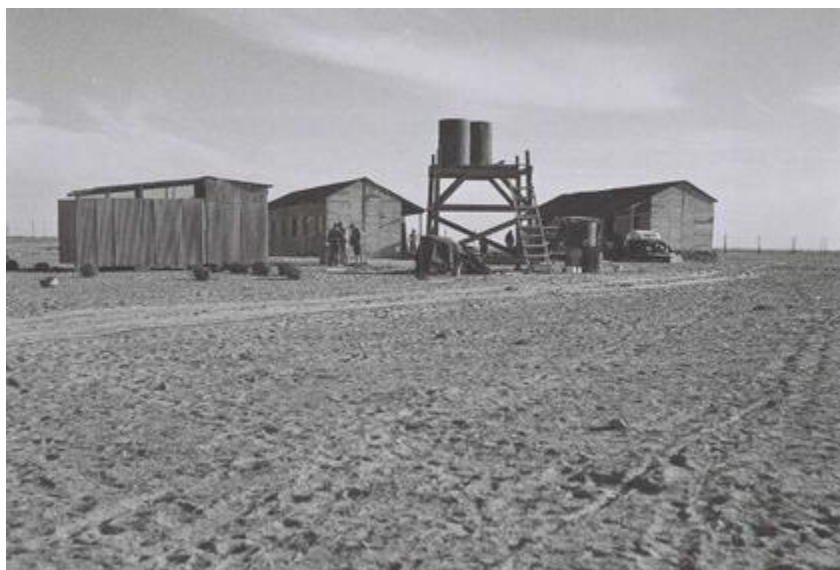
Kibbutz Tze'elim at its creation in 1949

In response to the relative failure to integrate the immigrants who arrived during the 1950s, a failure to which the kibbutz greatly contributed, during the 1960s and 70s, two population sectors crystallized in Israeli Jewish society, which instead of “merging” 2 into one culture based on the model advocated then by the elites, formed cultural alternatives which would lead to post-Zionism (Kimmerling 2001). On the one hand was the Israel of the elders from the pre-State period (“ vatikim ”), the Ashkenazi socio-economic elite; and on the other, the newcomers, primarily Middle Easterners, proletariats from peripheral regions. In this divide, the kibbutz was no longer perceived as a revolutionary, avant-garde socialist movement, a utopia thirsting for social justice, but rather as one of the privileged pockets of society, using an “uncouth” proletariat of middle-eastern origin for its own productivist purposes. As a matter of fact, while although ideologically opposed to salaried work due to the exploitation that goes with it, on the periphery of Israel’s (social) space, the kibbutz became one of the main, if not the main, employer.