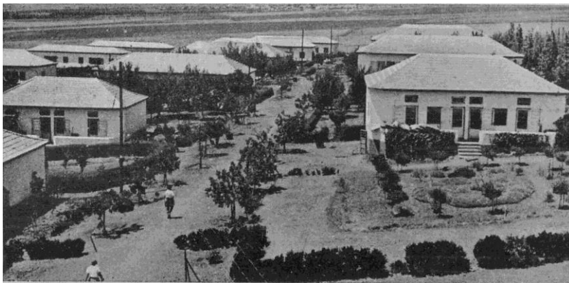
View of the Kibbutz Ein Harod, founded in 1921, in the 40s.

The cultural changes in the last twenty years have resulted in a new treatment of the space inside the kibbutz, reflecting today's predominant values and the accompanying trend toward privatization. While the kibbutz landscape used to express social justice founded on equality and collective ownership in its allocation of space, this landscape gradually transformed, consecrating