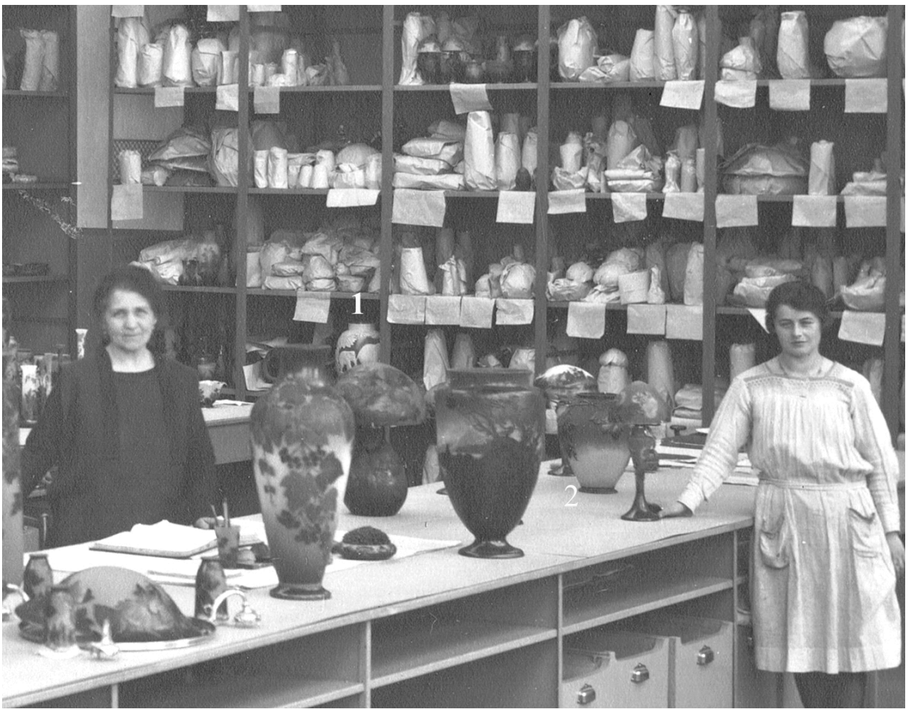
View of the packing room at the Etablissements Gallé, late 1920s, including a white mold-blown 'Elephants' vase on a shelf (n° 1) and, on the table, a 'Plum' mold-blown vase (n° 2).

1926, he remarks that the “[cast-iron] molds with relief have been recently in use to produce the large relief pieces such as the oranges, the apples, the elephants and the crabs series, and so on.” This important testimony, which gives also the official generic name of these series, the “vases à reliefs,” is indirectly confirmed by other sources. In his 1974 memoirs as a worker in the Etablissements Gallé, René Dézavelle, placed their creation around 1925.