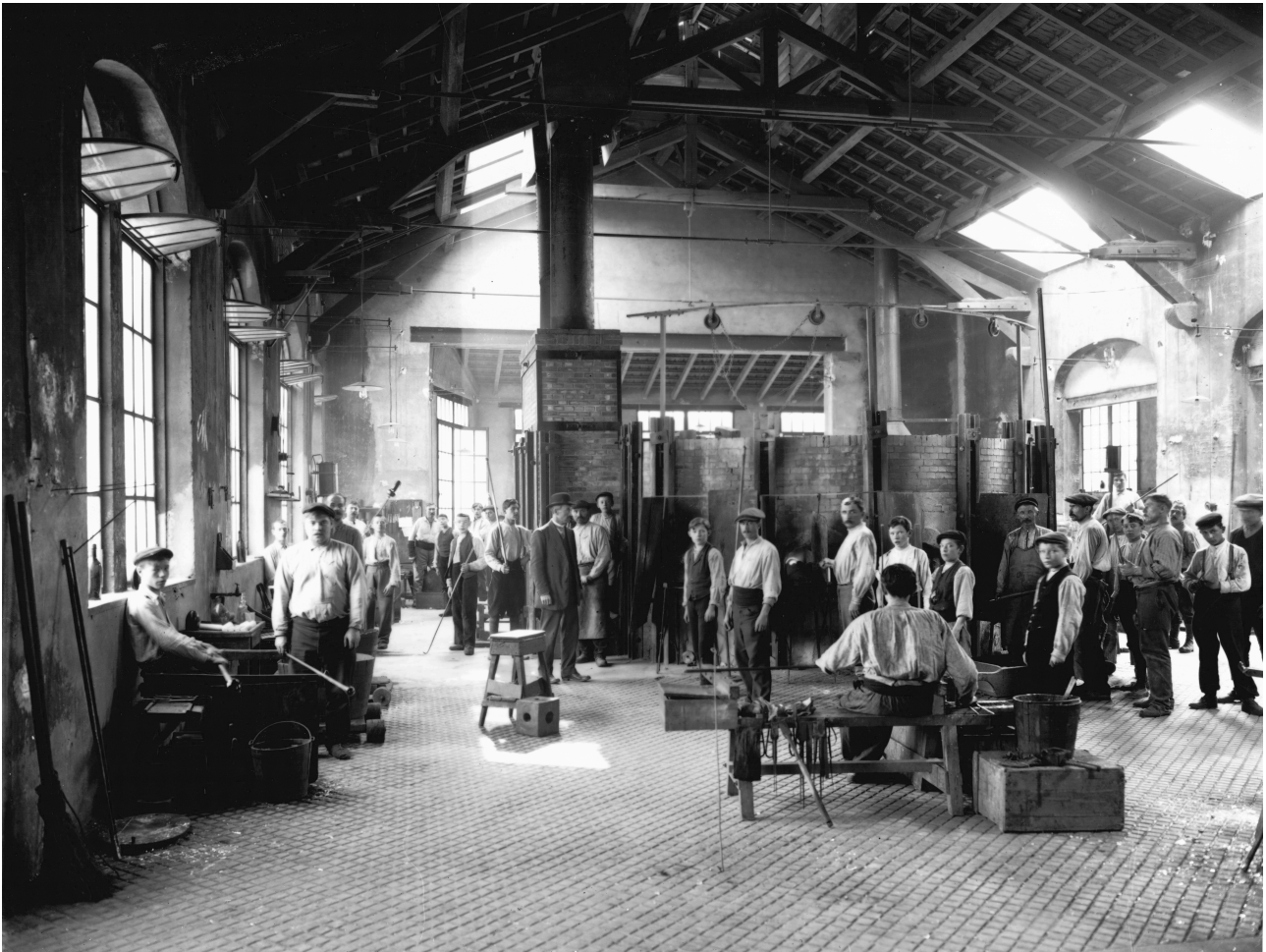
View of the glass furnace workshop in the Etablissements Galle, undated photograph.

The last period of the Etablissements Gallé, from his widow Henriette's death in 1914 to the clearance sale of the ateliers in 1936, was paradoxically the most productive and commercially successful, and yet it is the least known. This period is usually dismissed with the suggestion that the Etablissements Gallé perfected the simplest and most cost-effective techniques practiced by Emile Gallé, while giving up on his more ambitious experiments and failing to rejuvenate their line of products with inspired new designs. This summary fails to account for several significant innovations or for the introduction of new designs reflecting evolutions in taste.