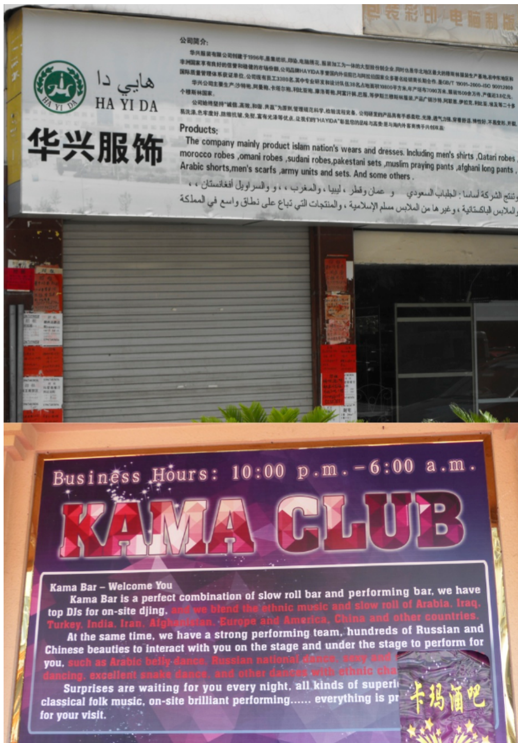
Figure 3: Leisure and Wholesale: Two Services Offered to Visitors

exchange news. The managers of the shops are foreign or Chinese, while the staff is mostly Chinese, either Muslim Uighur or Hui (Allès 2011). All are Muslim and Arabic is their lingua franca (Figure 3). The neighborhood is a condensed form of activity in Yiwu, a microcosm where wholesalers and new migrants interact (although they are present throughout the city).