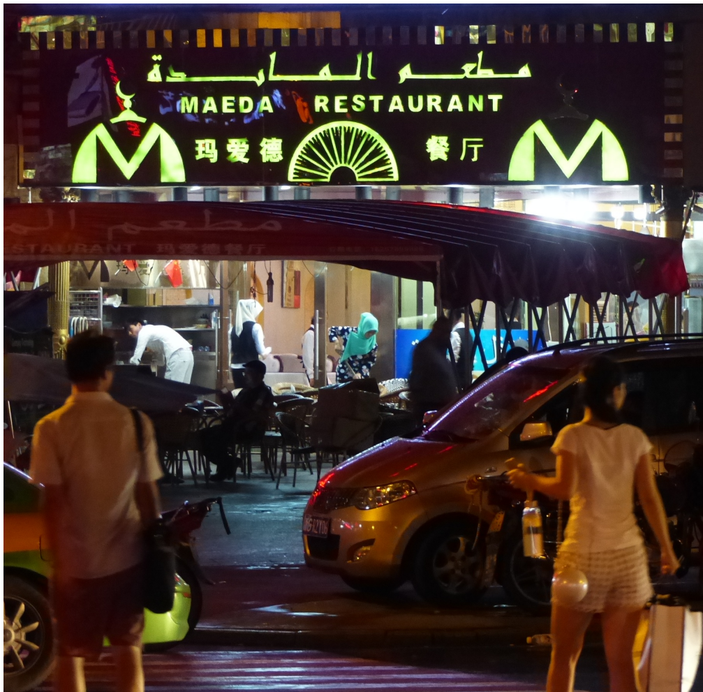
Figure 2: El Maedah, First Arab Restaurant in Yiwu