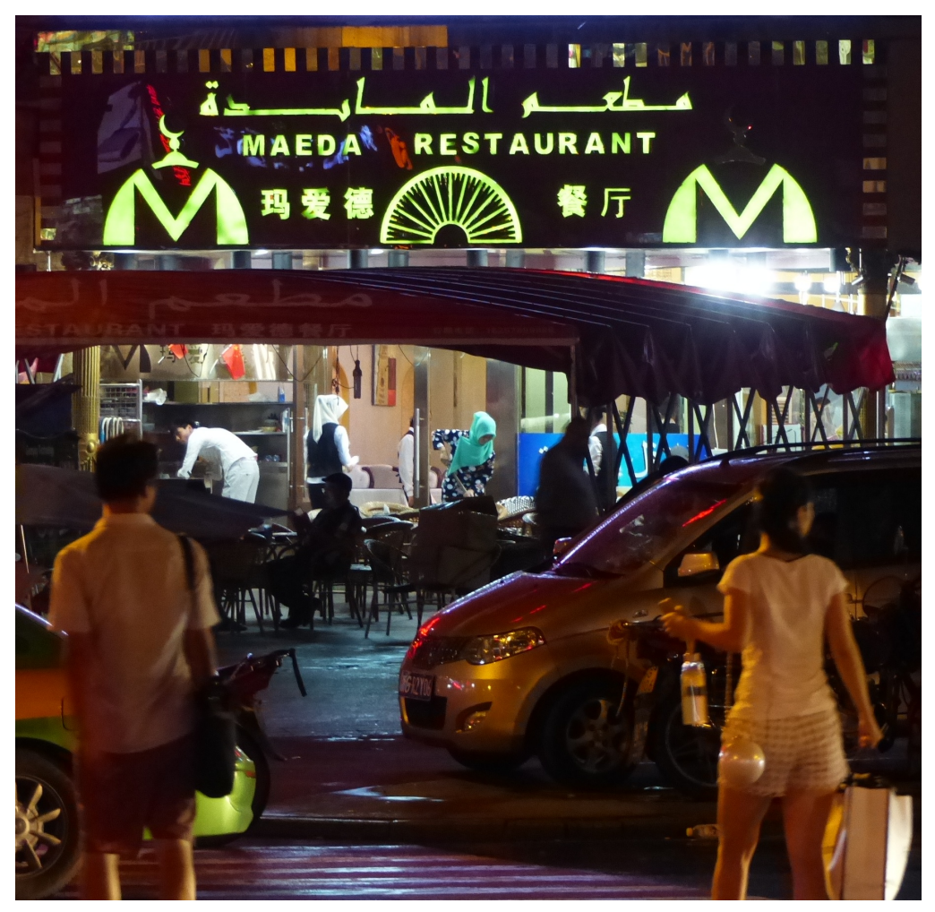
Figure 2: El Maedah, First Arab Restaurant in Yiwu