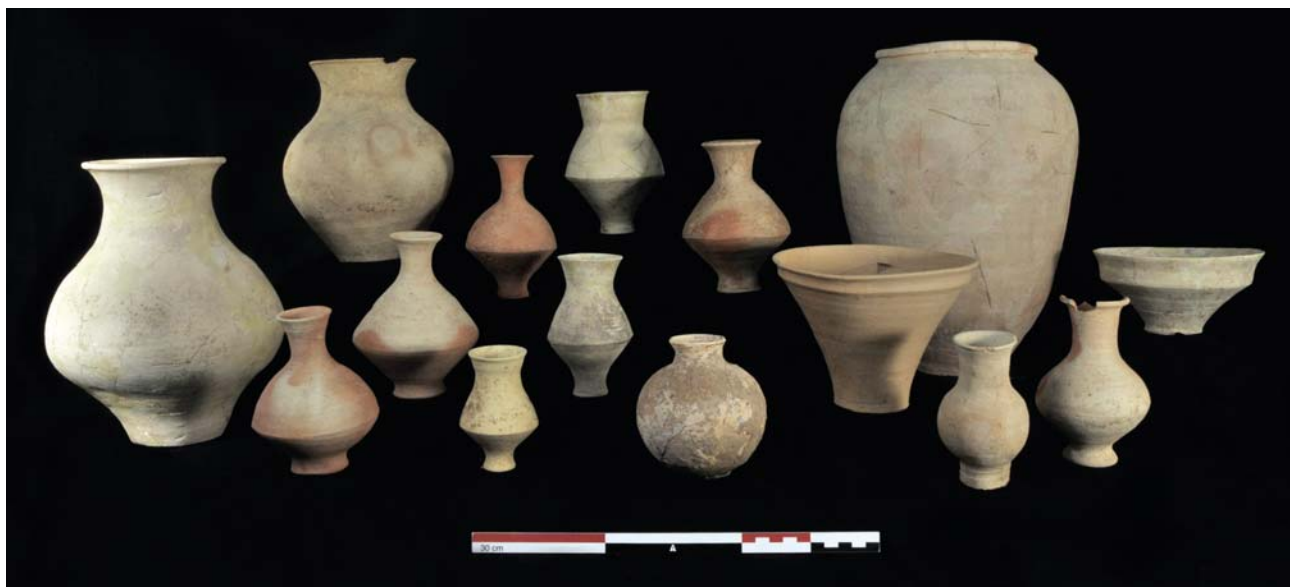
Fig. 2. Ceramic vases characteristic of the Namazga V period.

of Altyn-depe. The same kind of prestigious material, more ritual than utilitarian, was found on the terrace of Tureng Tepe, and the terrace of Ulug-depe seems to adopt the same rule.