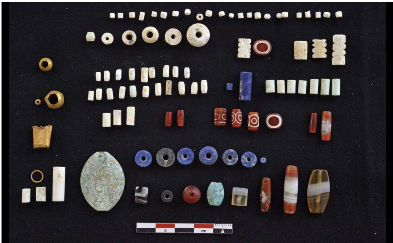
Fig. 6. Jewellery pieces of exceptional burial.