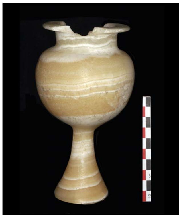
Fig. 5. «Chalice» alabaster vase.

As well as the beads, alabaster vessel occupies a significant place in the inter-Iranian trade, and illustrates once more the opulence of this exceptional ensemble, and of the female individual who was buried in this grave. This observation leads us to wonder about the social relations between genders, and the strong role that women could have in the proto-historic societies of Central Asia (Luneau, 2008, 2014).