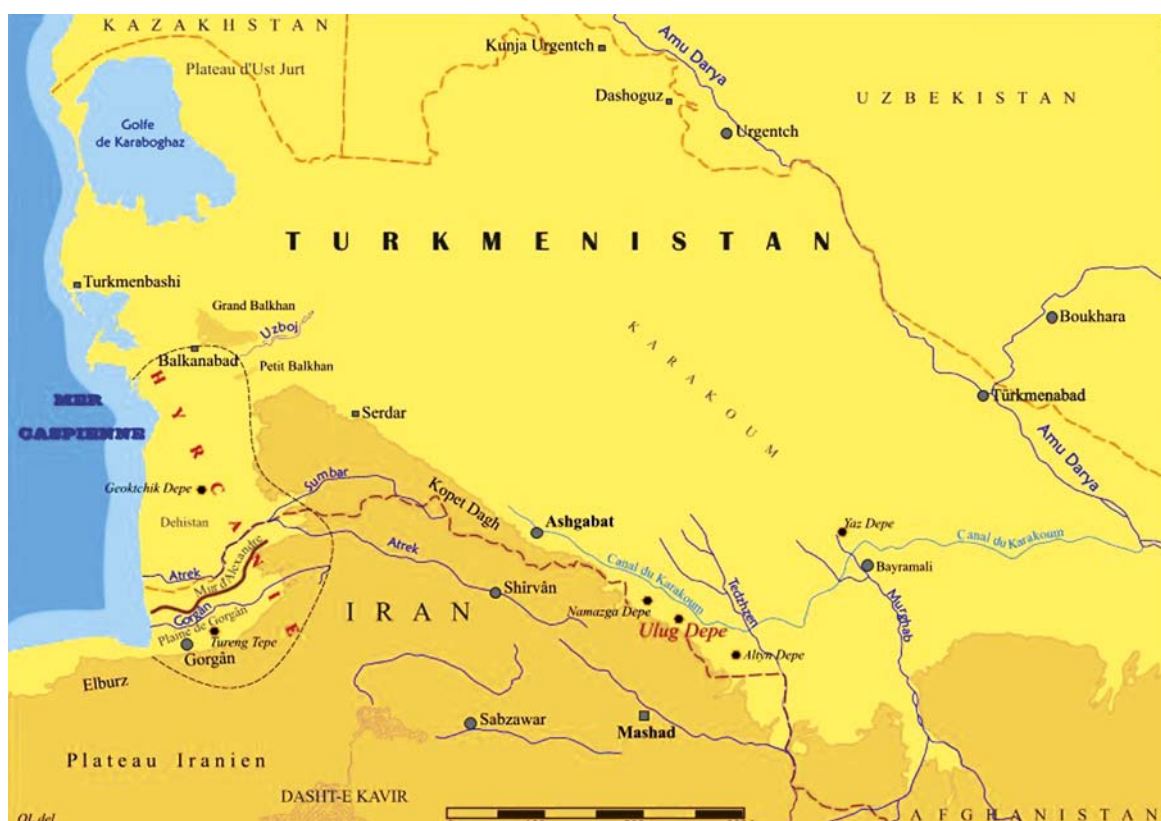
Fig. 1. Ulug-depe between Namazga-depe and Altyn-depe.

Smaller than Namazga-depe and Altyn-depe, Ulug-depe stretches on an area of 13–15 ha on the top and 26 ha at its base, to a height of over 30 m. Its current elevation does probably not match its physical and historical reality, and ten meters can easily be added to its height, as the proximity of Kopet Dag (13 km away), and the close presence of a ancient bed of the Kelet river caused many episodes of colluvium and alluvial deposits.