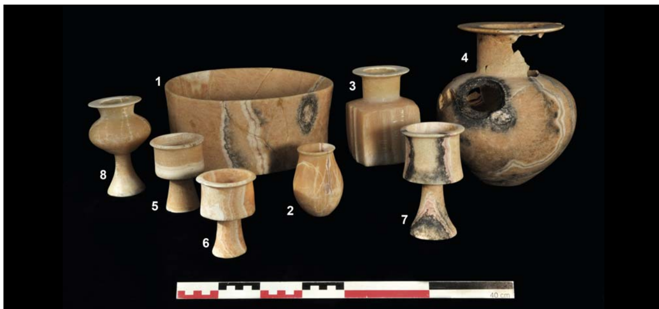
Fig. 4. Alabaster vases.

The goblets with cylindrical body are among the items traded with the Indus civilization, exchanges attested to by the treasure of Quetta, which contains two “chalices” of this type (Catalog, 1988. N 168–169).