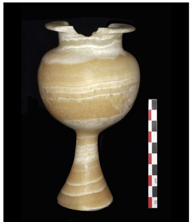
Fig. 5. «Chalice» alabaster vase.

As well as the beads, alabaster vessel occupies a significant place in the inter-Iranian trade, and illustrates once more the opulence of this exceptional ensemble, and of the female individual who was buried in this grave. This observation leads us to wonder about the social relations between genders, and the strong role that women could have in the proto-historic societies of Central Asia (Luneau, 2008, 2014).