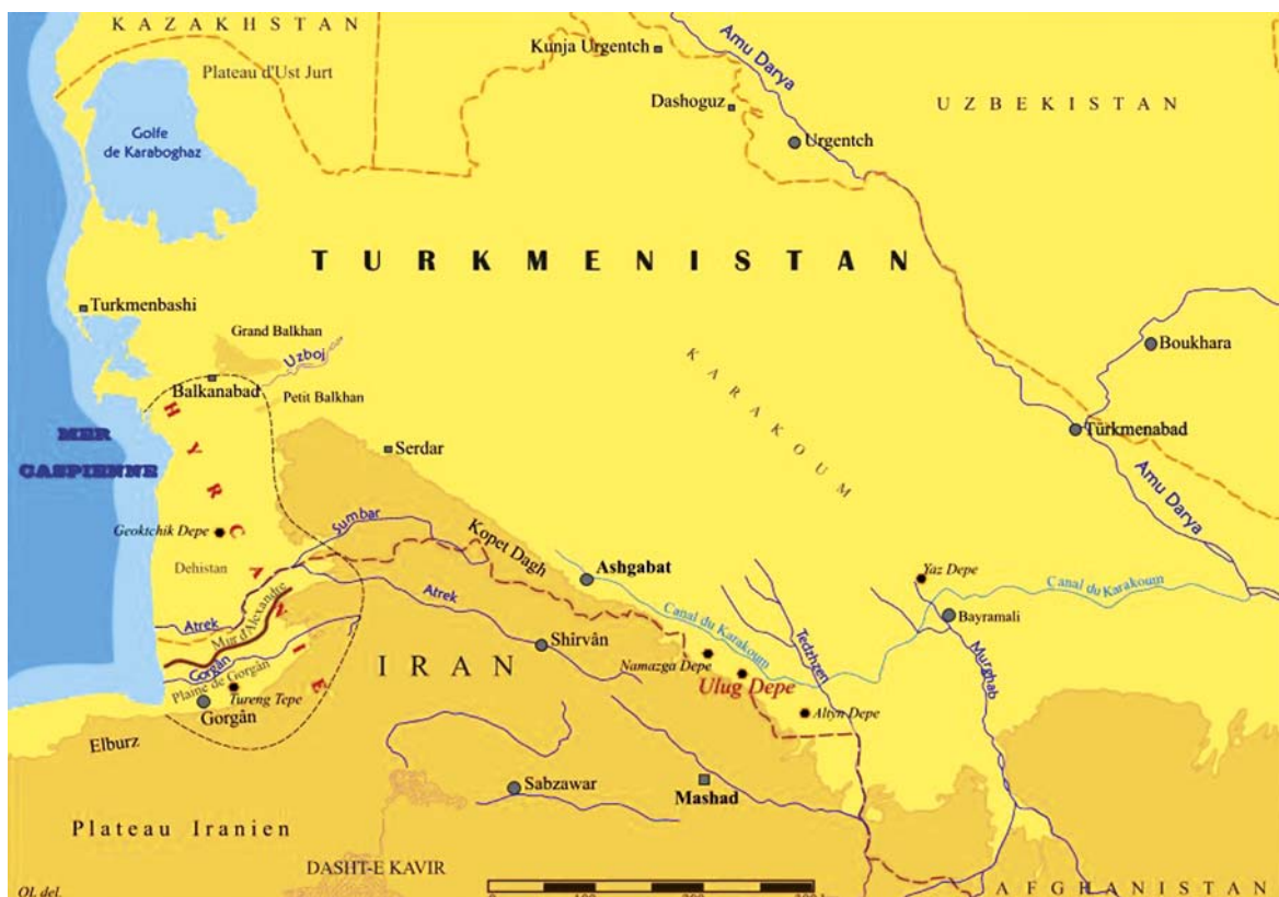
Fig. 1. Ulug-depe between Namazga-depe and Altyn-depe.

Smaller than Namazga-depe and Altyn-depe, Ulug-depe stretches on an area of 13–15 ha on the top and 26 ha at its base, to a height of over 30 m. Its current elevation does probably not match its physical and historical reality, and ten meters can easily be added to its height, as the proximity of Kopet Dagh (13 km away), and the close presence of a ancient bed of the Kelet river caused many episodes of colluvium and alluvial deposits.