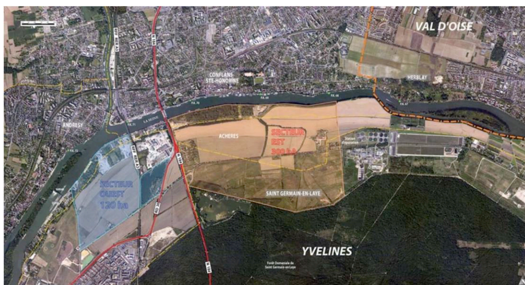
Figure 7. The different sectors of the future port in Achères

turns of events leave a mark, as physically, as administratively. What remains unseen on the field can have an existence and consequences which are important. The administrative factor, far from being virtual, allows the development of unexpected habits. The plain, as it keeps waiting for either the harbour or the road, remains an open place, as a direct consequence of the conflicts and differences between temporalities and projects. In the case of Achères, we are the witnesses of an impressive ratio of different uses on a site which is though highly contaminated, due to one century receiving Paris' dirty sewer waters. Agriculture, although declared unfit, remains, through the market gardening and the kitchen gardens. Moreover, these lands without official use fit for activities that doesn't find space elsewhere: dog training, driving schools for both cars and motorbikes, airfields and hangars for model aircraft making, fishing and hunting on a background of garbage dumps and rubbles. Hybridity diversifies itself and therefore does add to the official habits and practices, which are already transforming sites in vast patchworks, its own "counter-cultures". These are also spaces of freedom, where gypsies, could, for a time, find a shelter. These places, being dismissed by upcoming projects, are places of possibilities and multiplication of habits.