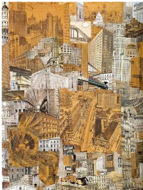
Figure 1. P. Citroen, Metropolis , 1923

To answer to this evolution and the dismay it has provoked, a movement of defence and of comeback to the city appears in the 1970's. The Italian theorists, known as « La Tendenza » (the Tendency) were the last to use the term “city” in its historical meaning. The fundament of this idea, Aldo Rossi's book The Architecture of the city , proposes a structural reading and the conceptual reinterpretation of the parts of the city (centre and outskirts). According to Rossi and the followers of La Tendenza, the historical city has its own architecture and principles of composition which are permanent and independent of their function. Within the relatively fix limits of the town centres, from a decade to another, functions do evolve, buildings keep moving, adapting themselves to the evolution of the ways of life as of the market's. But what happens to be true in the restricted area of the historical centres (which cover only 10% of the agglomeration's whole surface) isn't the same as soon as we move away from them.