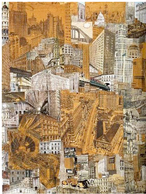
Figure 1. P. Citroen, Metropolis , 1923

To answer to this evolution and the dismay it has provoked, a movement of defence and of comeback to the city appears in the 1970's. The Italian theorists, known as « La Tendenza » (the Tendency) were the last to use the term "city" in its historical meaning. The fundament of this idea, Aldo Rossi's book The Architecture of the city , proposes a structural reading and the conceptual reinterpretation of the parts of the city (centre and outskirts). According to Rossi and the followers of La Tendenza, the historical city has its own architecture and principles of composition which are permanent and independent of their function. Within the relatively fix limits of the town centres, from a decade to another, functions do evolve, buildings keep moving, adapting themselves to the evolution of the ways of life as of the market's. But what happens to be true in the restricted area of the historical centres (which cover only 10% of the agglomeration's whole surface) isn't the same as soon as we move away from them.