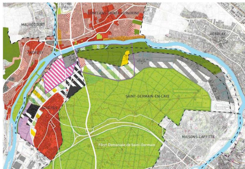
Figure 6. The hardly decipherable administrative patchwork

The third characteristic feature of hybridity comes under the plurality of the authorities. The loop of the Seine, where Achères is located, is divided between different communes, each one having its own particular vocation: Saint-Germain-en-Laye and Maisons-Laffitte are a legacy of the aristocratic and royal hunts; Poissy, an ancient abbey, became an industrial city dedicated to the car industry. More unexpected is the case of Andrésy, which, although it is located on the right banks, does as well include some parts of the left banks, the reason being some old rights of grazing. This division of the meander is characteristic of a functional division of the lands, according to their nature: plain for the grazing, the cottages to the vineyards; the lands which are not subject to flooding go to the dwellings and the village; the centre of the meander goes to the forest. We are in a case of coherence, of resilience, as approached in the second characteristic feature, except that Achères has only limited powers over its own territory. Indeed, the region is monopolized by Paris, which discharges its sewers there, by the region, which plans to build sections of motorways, and henceforth by the State and the Grand Paris, in order to realize their 400 hectares huge harbour. This phenomenon of different powers, at different scales, but applied at the same site, or another source of hybridization of the territories.