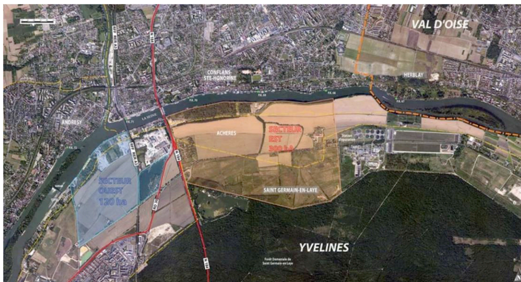
Figure 7. The different sectors of the future port in Achères

turns of events leave a mark, as physically, as administratively. What remains unseen on the field can have an existence and consequences which are important. The administrative factor, far from being virtual, allows the development of unexpected habits. The plain, as it keeps waiting for either the harbour or the road, remains an open place, as a direct consequence of the conflicts and differences between temporalities and projects. In the case of Achères, we are the witnesses of an impressive ratio of different uses on a site which is though highly contaminated, due to one century receiving Paris' dirty sewer waters. Agriculture, although declared unfit, remains, through the market gardening and the kitchen gardens. Moreover, these lands without official use fit for activities that doesn't find space elsewhere: dog training, driving schools for both cars and motorbikes, airfields and hangars for model aircraft making, fishing and hunting on a background of garbage dumps and rubbles. Hybridity diversifies itself and therefore does add to the official habits and practices, which are already transforming sites in vast patchworks, its own "counter-cultures". These are also spaces of freedom, where gypsies, could, for a time, find a shelter. These places, being dismissed by upcoming projects, are places of possibilities and multiplication of habits.