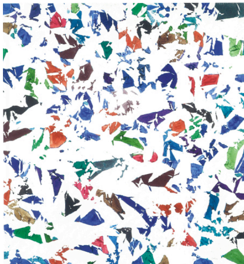
Figure 2. S. Hantai, Blanc , 1974

As we said in the introduction, the city is a concept which happened to be ineffective because it amalgamates too different realities. On the other hand, the units which compose the urbanized territory, its “fragments”, are able, at their own level, to explain the specificity of each situation. Therefore, it is through its fragments that the city shall be read. B. Secchi’s proposal, in First lesson of town planning (2003, 77) is particularly enlightening, since he suggests to observe the city and the territory with the eyes of the archaeologist, where “the different historical layers, the ancient centre, the modern city and its outskirts, the fragmentation and the dispersal of the contemporary city, did mix with each other as after a telluric move”. Therefore, it is through its fragments that we shall read the city. We have to reverse our glance and read the city as a set of fragments, accept its heterogeneity, and accept what the term “city” contains of hybridity and its generic side. This positioning allows us to avoid the false recomposition rhetoric, of the consolidated order and of the urban hierarchy that should be found back. But how shall we define and describe the fragment as the minimal unity of the contemporary territory? How shall we explain its insertion in a network of relations?