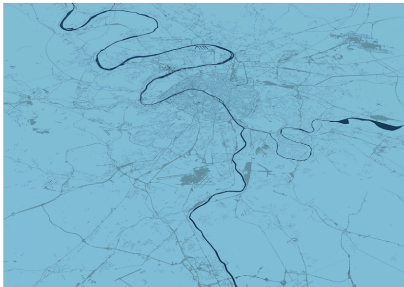
Figure 3. MVRDV+AAF+ACS, The Grand Paris

As architects and geographers, we naturally arrive to the point when we use this comprehension's mode as a tool for projects, a mean to act on reality, as, for instance, in the consultations concerning the Grand Paris. The Grand Paris is a project whose goal is to put together the fragments of the Parisian Region's territory. Seven years after the first international consultation in 2007 with 15 international teams, we can finally draw up the balance sheet of its results. What happened to be the main limit of this long process is a cultural resistance to come to terms, in the Grand Paris project, with the fragments of the Parisian territory as with as much autonomous identity realities. Beyond the initial conditions, the scenario of transformation proposed by the Grand Paris have too often been over-simplistic and too demagogic, facing really complex intermediary spaces, whose the capacity to hold together different scales, from the neighbourhood to the vast territory, should have been highlighted.