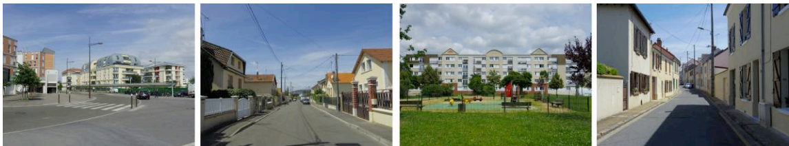
Figure 4. Achères : The different urban fabrics of Achères

In Achères, the first criteria of recognition of the hybridity of a Grand Paris' fragment, is the relativity of the different point of views. It is an approach which does allow the « drift », so appreciated by the post-surrealists. You let yourselves being "carried" by the place, by its subjectivity, subjectivity being itself made of thousands of prejudices no matter what your level of knowledge or of objective pretention might be. Achères has been covered both by walking and by car, in different years, in different months, days and hours. Each of these "drifts" has given birth to texts, drawings and pictures. The analysis of these heterogeneous materials itself, does reveal that hybridity is a matter of point of views, of postures, of whether attention or indifference to what makes the wealth of a place. Achères appeared successively as: a vast plain being bashed around by Modernity (roads, malls, aggressive promotional notice boards), as a village wishing to preserve its ancestral identity, with its roman church, its market square, with all the facilities indispensable to local life (an art house, local shops), as a dormitory-suburb made of big social buildings, but also of plots of individual houses. These houses being nestled among the bottom of the Forest of Saint-Germain, like an "open