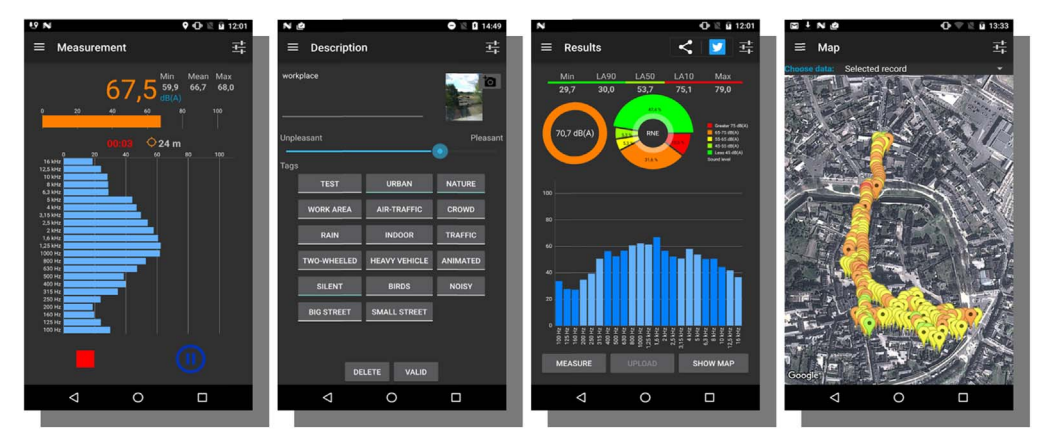
Fig. 1. Screenshots of the NoiseCapture application (from left to right: measurement / perception / acoustic indicators / map).

A volunteer moves along a given path and performs a continuous acoustic measurement using the NoiseCapture application (Fig. 1). Audio data are then processed by the smartphone to produce results in a form of acoustic indicators (equivalent noise level LAeq, percentile indicators (LA10, LA50, LA90), min and max values of the sound level...). The user can also complete the measurement with information about his own perception of the sound environment, using tags and an information of pleasantness. Some data are then uploaded to a geoserver in order to process data and to build a noise map that merge all community results (community data are aggregated in hexagonal areas in order to produce a basic noise maps). This operation is done thanks to the Web Processing Service. It must be note that only the LAeq data are transferred to the geoserver, since all other parameters can be