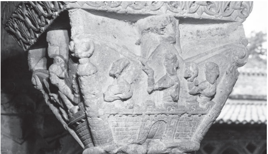
Fig. 17: Moissac (France), cloister abbey, Holy City capital, detail © J. Michaud, CESC/CIFM.

Paradoxically, inscriptions in doorways invite the reader to stop; to suspend the movement induced by crossing the doorway. The content of epigraphic texts relies on the social, liturgical and broadly symbolic implications of changes in space to transform the suspension of the reader's movement into a dramatic understanding of the precise features of the space he is entering. On the Moissac capital, narrative tension is concentrated at three points: on the gates to Jerusalem; on the long sides of the basket where the character sculpted behind the walls points to the city's door; and on the door that provides access to the church (fig. 17).