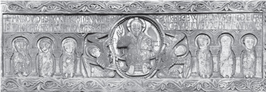
Fig. 4: Saint-Genis-des-Fontaines (France), lintel of the church door © J. Michaud, CESC/M/CIFM.