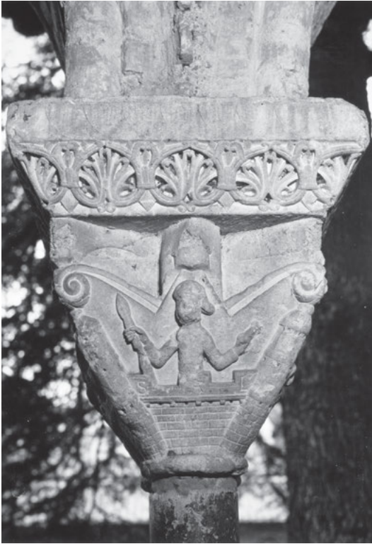
Fig. 10: Moissac (France), cloister abbey, Holy City capital, detail © J. Michaud, CESC/CIFM.

The main part of the capital presents the image of a walled city located under a foliate frieze on the abacus, along with a blank tailloir . We can see that the artist has sculpted the bulwarks, high towers and monumental gates with care. The city walls are topped with a series of human figures, perhaps soldiers, defending the town. 20 On the long sides of the capital, these figures point their right arms towards the door of the abbey church on the opposite wall, indicating with their fingers the south gallery of the cloister and inviting the viewer to look beyond the capital (all the bodily movements create a dynamic towards the church wall— from the city wall on the capital towards the church wall in the cloister ). All around the bulwark (fig. 10) one can read the inscription sancta Iherusalem or Iherusalem sancta (depending on the point at which the reader begins). The city on the capital is not just a town but the town , the Holy City described in the Bible, 21 both in the Old Testament (as the historical place of God's people) and in the Book of Revelation (as the promise of God's realm). The