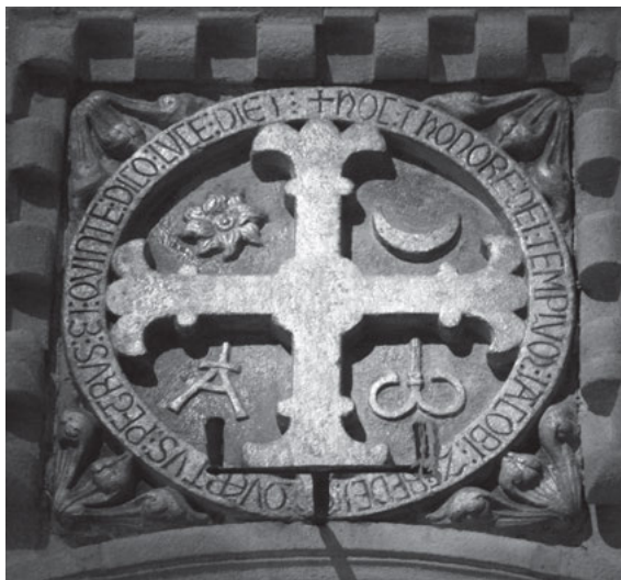
Fig. 11: Santiago de Compostela (Spain), cathedral, consecration cross © CESC/CIFM.

complex alphabetical composition combining two letters, and ends with a few words from Ps 54.3: Deus in nomine . In this scale representation of the capital, the Latin alphabet surrounds nature as if it has been shaped in stone. Christian exegesis of the alphabet associates the layout and number of letters with knowledge and creation. 31 The inscription in Moissac could be interpreted as follows: writing delimits and contains the sculpted shapes both in material and analogical terms.