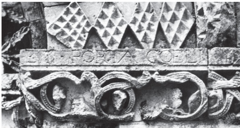
Fig. 1b: Saint-Pierre-de-l'Isle (France), western portal of the church © J. Michaud, CESC/CIFM.

As they often are iconic documents of medieval epigraphy—the monumental inscription of the portal of Saint Foy church in Conques 5 is published in all the catalogues dealing with Romanesque sculpture in France (fig. 2)—these inscriptions have been studied repeatedly by medievalists. 6 Nonetheless, as can be deduced from their titles, these works deal mainly with the content of the inscriptions and the symbolic, theological or iconographic implications of their location at the doors of churches. Such a lexical approach is essential and leads to a better understanding of how medieval inscriptions were composed according to their function. However, it tends to consider doorways and epigraphic writing as separate elements whose presence within a shared ‘writing space’ and ‘reading moment’ is either fortuitous or insignificant to the form and meaning of the architectural structures. 7