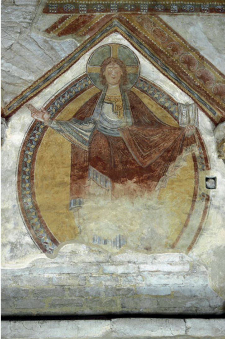
Fig. 19: Poitiers (France), St John Baptistery, central room © CESC/CIFM.

only aspirations. Because Jesus is Verbum Dei , this medieval graphic phenomenon plays on the deliberate ambiguity between the hyper-materiality of the written shapes and the absolute transcendence of its contents.