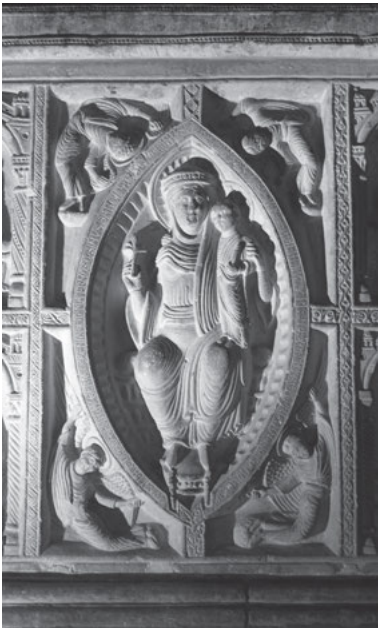
Fig. 13: Saint-Junien (France), church, Saint Junien's sarcophagus.