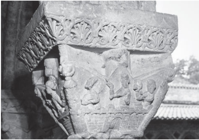
Fig. 9: Moissac (France), cloister abbey, Holy City capital © J. Michaud, CESC/M/CIFM.