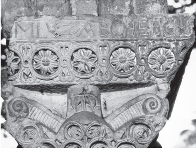
Fig. 12: Moissac (France), cloister abbey, alphabetical capital

movement from the outside inward: both the act of reading and the poetic content lead the viewer's eyes and mind into the heart of the visual construction.