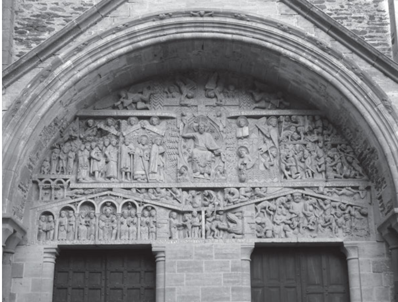
Fig. 2: Conques (France), Sainte-Foy abbey, western portal of the church © Vincent Debais.

passage that allows to enter spaces that lack a door or open those defined by their separate and inaccessible nature.