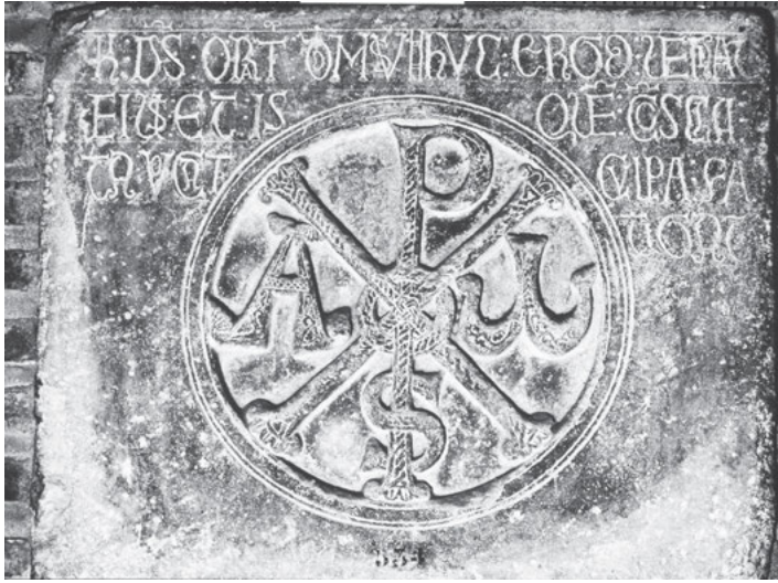
Fig. 15: Toulouse (France), Musée des Augustins, chrismon from Hospitalliers church