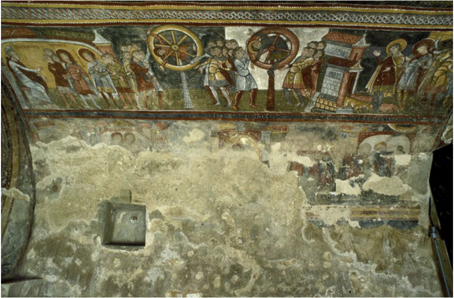
Fig. 18: Saint-Savin-sur-Gartempe (France), abbey church, wall painting in the crypt © Vincent Debiais.