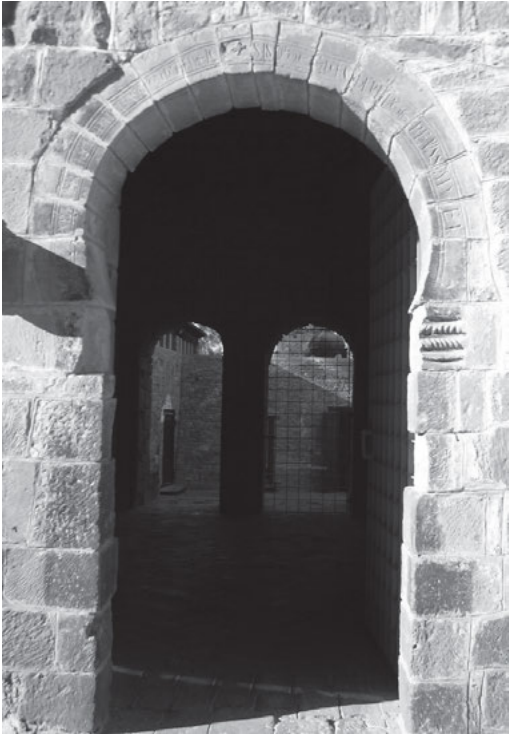
Fig. 3: San Juan de la Peña (Spain), monastery, cloister door © CESC/M/CIFM.