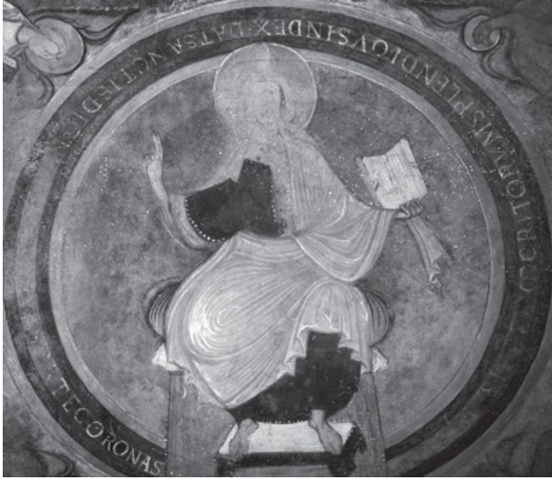
Fig. 14: Saint-Savin-sur-Gartempe (France), abbey church, vault of the crypt © Vincent Debiais.