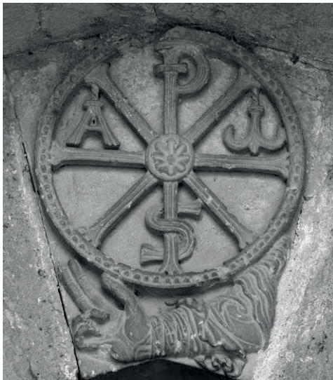
Fig. 16: Irache (Spain), Santa María la Real abbey, church doors © Vincent Debiais.

The three doors of the church are stamped with a chrismon: the west door, opening to the outside; the north one, facing the Camino de Santiago and giving access to the pilgrims; and the south one, opening onto the cloister and reserved for the monastic community. With a lasting representation of the crosses traced with Holy Oil during the liturgical ceremony of consecration, Irache's chrismated doors can be considered