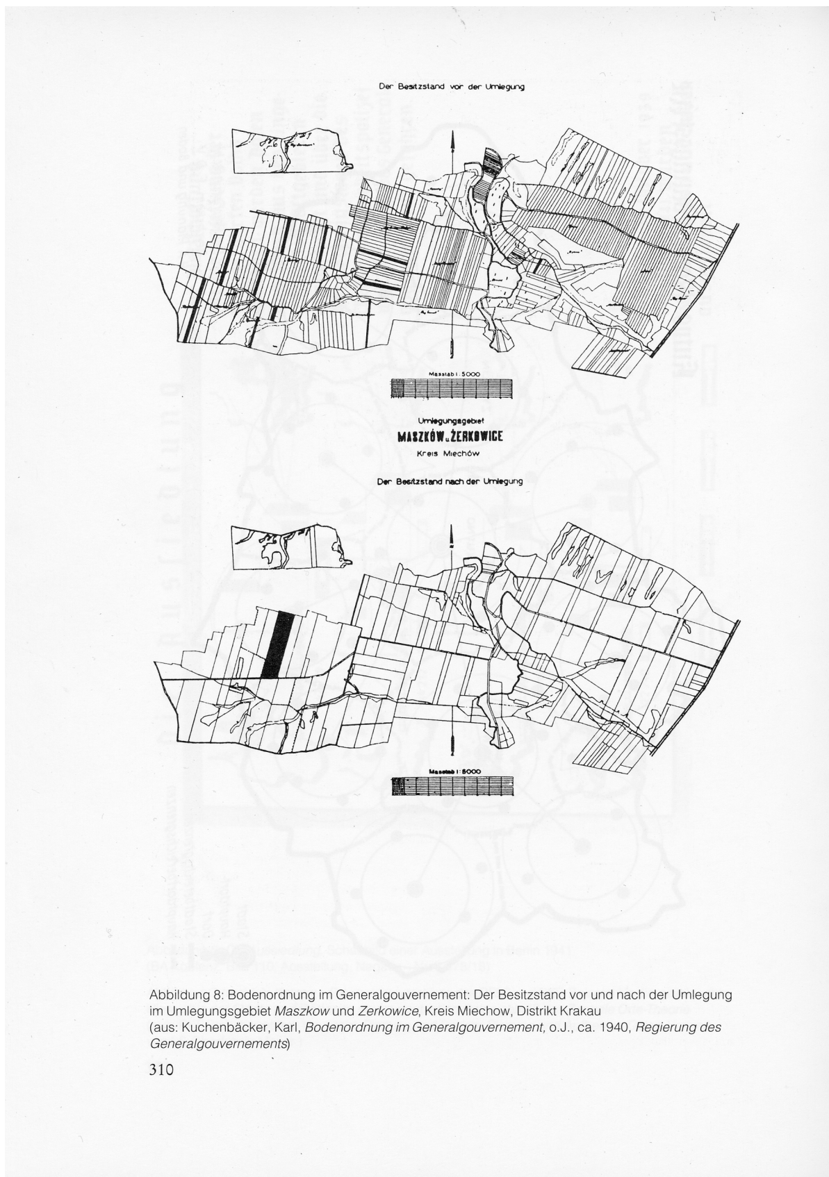
Abbildung 8: Bodenordnung im Generalgouvernement: Der Besitzstand vor und nach der Umlegung im Umlegungsgebiet Maszkow und Zerkowice, Kreis Miechow, Distrikt Krakau (aus: Kuchenbäcker, Karl, Bodenordnung im Generalgouvernement , o.J., ca. 1940, Regierung des Generalgouvernements )

and very small estates (top of the page) in Poland, was transformed into a set of quite similar ones (down the page).