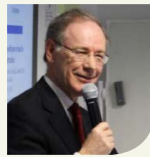
Professor at the University of Paris IV-Sorbonne ; President of the journal Population & Avenir .