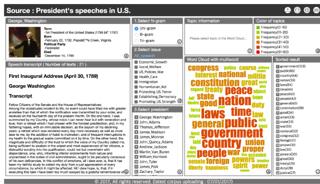
Figure 2: Visual system interface. The interface of our visual system represents corpus data of speeches from 43 U.S. presidents from George Washington to Barack Obama.

Figure 2 depicts the main workspace of our visual system after loading all the presidents' speeches. Three buttons in the middle of layer headers (figure 2 (c)) provide options for changing topic word combinations by the value of N in each N -gram. Additionally, users can change visual result by selecting options in the middle (figure 2 (d), (e)), making our system very flexible because different visual results of a president's speech can be viewed easily.