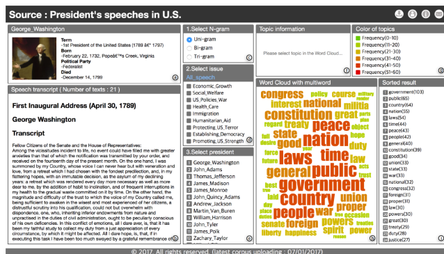
Figure 2: Visual system interface. The interface of our visual system represents corpus data of speeches from 43 U.S. presidents from George Washington to Barack Obama.

Figure 2 depicts the main workspace of our visual system after loading all the presidents' speeches. Three buttons in the middle of layer headers (figure 2 (c)) provide options for changing topic word combinations by the value of N in each N -gram. Additionally, users can change visual result by selecting options in the middle (figure 2 (d), (e)), making our system very flexible because different visual results of a president's speech can be viewed easily.