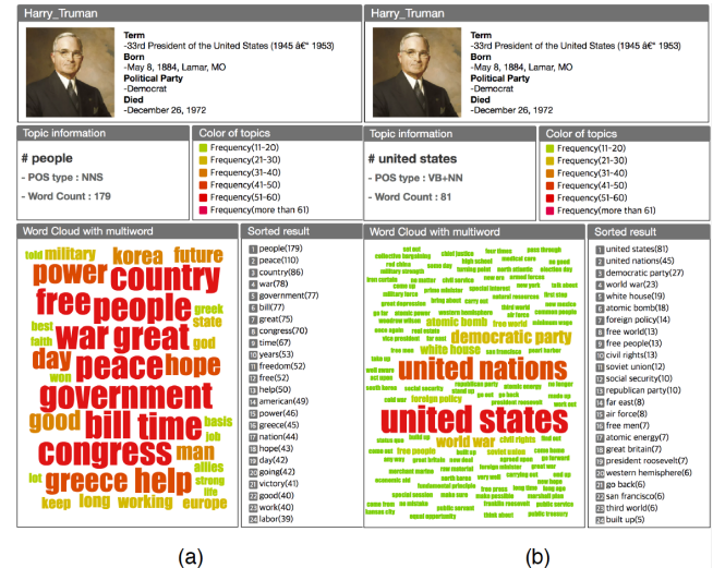
Figure 3: Analysis result of Harry Truman's speech by (a) unigram and (b) bigram.

We conducted case studies to evaluate the effectiveness and usability of our system. We worked with computational linguistics researchers who study multiword topic analysis and have expert knowledge of it. They used our system to find information about their research questions.