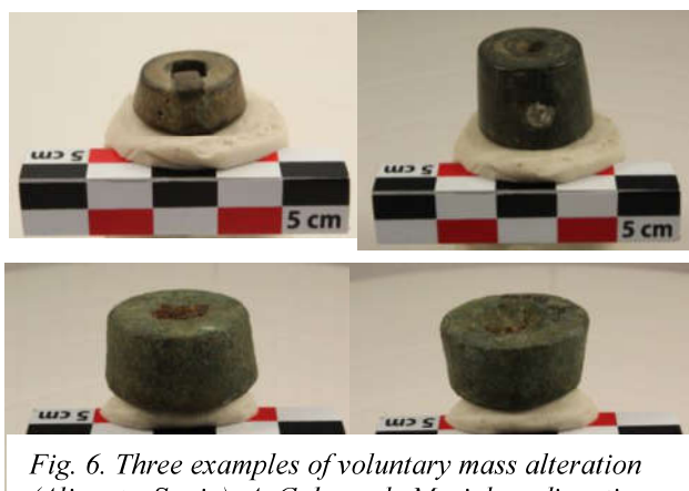
Fig. 6. Three examples of voluntary mass alteration (Alicante, Spain). A. Cabeço de Mariola, adjunction of a copper-alloy sheet rolled around the weight ; B. Ex Xarpolar, secondary perforation filled by lead ; C. and D. La Serreta, central perforation filled by iron and base digged.