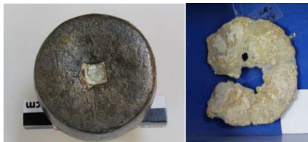
Fig. 1. A copper-alloy weight with its perforation filled with lead and a broken lead weight. Alcludia de Elche (Spain).

In this domain, the Iberian Peninsula is the well-studied area, from the Late Bronze Age to the Roman Period. An original type of weight, presented as a cylindroid piece of copper alloy or lead, perforated in its center, is identified since the 30's [2]. During the next decades, many authors worked on the subject and, particularly, on the metrological aspect of this artefacts. Indeed, the weights have the particularity to be interesting in their typological