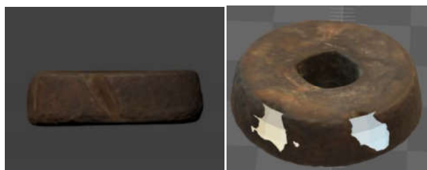
Fig. 5. Numerical model of the weight Cig-F, from the tomb 200 (El Cigarralejo, Murcia Spain), before and after the filling of the notches.

and the numerical reconstruction to approach their original mass. Even if their weighing function remained to be confirmed, the photogrammetry gave interesting results concerning the density and the reconstructed masses, permitting to propose a hypothetical weighing system. One of the most interesting elements is the restitution of the only bispherical object as twice the standard found studying the relation between the object masses (Fig. 4).