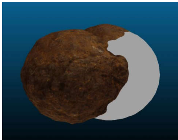
Fig. 4. Numerical reconstitution of the possible weight G from Malvieu (Hérault, France)