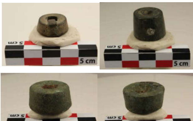
Fig. 6. Three examples of voluntary mass alteration (Alicante, Spain). A. Cabeço de Mariola, adjunction of a copper-alloy sheet rolled around the weight ; B. Ex Xarpolar, secondary perforation filled by lead ; C. and D. La Serreta, central perforation filled by iron and base digged.