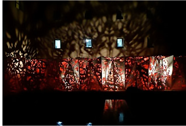
Figure 3: Couvent Sainte Cécil , expo. Peinture + Architecture , Grenoble (2010).

Levels of transparency: The back-plan and the events co-emerge in a dynamic relation that varies according to time and create sensible contrasts between perception, action and existence. Through the experience of improvisation people are encouraged to choose when and how they will experience the space. In that sense real is what excites them (e.g. soundwalk in Gijon cemetery by NoTours).