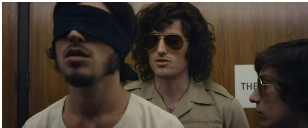
Figure 5 – Exercising control and authority with simple grammar

“Now I want you to strip” ( The Stanford Prison Experiment 2015) (Guard 1) Which one of us should start? (Guard 2) Well, I’ll do it. (Addressing the blindfolded prisoner) Um. Oh. OK. Feet apart. Wider. I said “wider.” (Prisoner 8612) You guys, this doesn’t have to be... (Guard 2) Just keep your hands on the wall. (Smiles) Ok, just keep your hands on the wall. Um, put your head down. (Prisoner chuckles) Uh, take off your shoes. (Guard 3 picks them up and puts them into a box). Ok. Um... Put your hands at your sides. Now I want you to strip. (Prisoner scoffs)