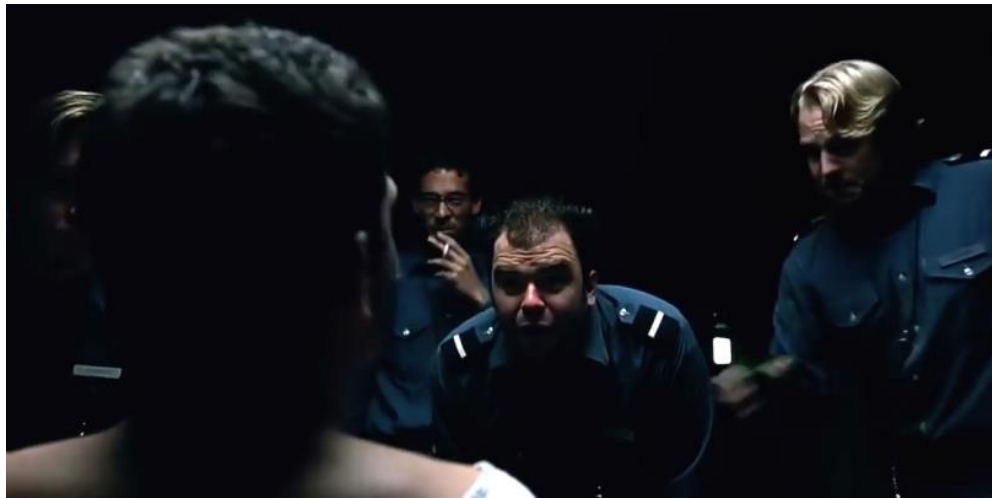
Figure 4 – Confrontation between guards and prisoner 7

“You stupid little asshole! You think you’re smart!” ( Das Experiment 2001)