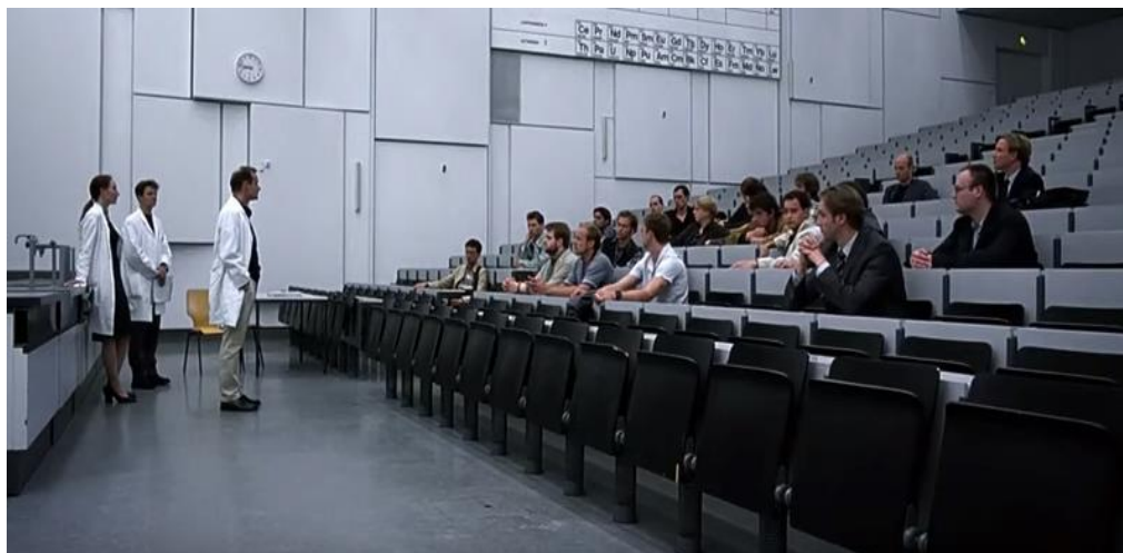
Figure 3 – Issuing and receiving instructions ( Das Experiment 2001)

The division of space between instructors (researchers) and students is maintained. Speakers and listeners adopt bodily postures that are both relaxed and respectful. Mutual attention is sustained. It is hard to imagine, at