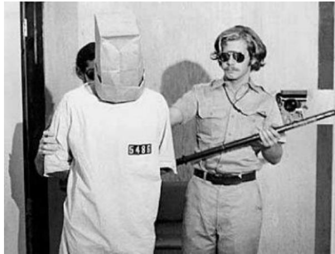
Figure 1 – The Stanford Prison Experiment (1971) - Prisoners and guards