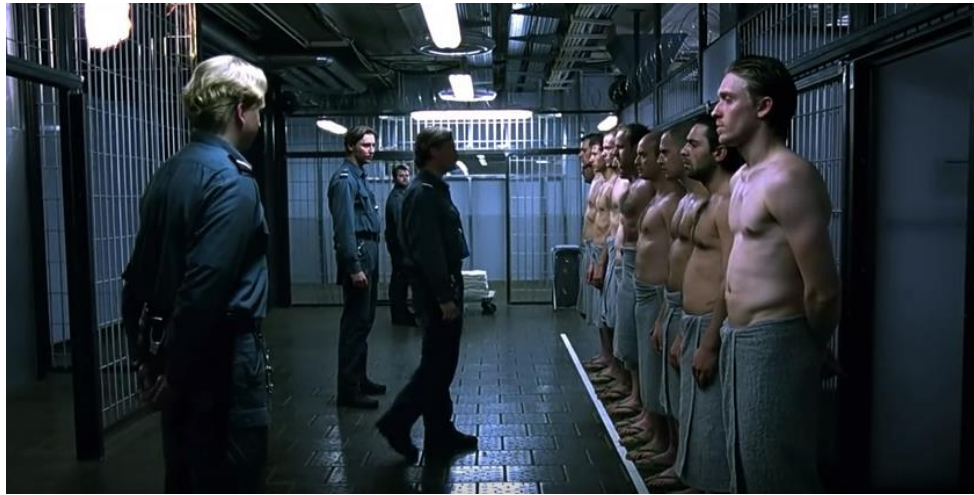
Figure 2 – Prisoner lineup ( Das Experiment 2001)

The film was well distributed in Europe and America, and officially described as a “psychological thriller” inspired by real life incidents that had occurred at Stanford University, Palo Alto, California, during a psychological experiment. Although it incorporated recognizable features of Zimbardo’s prison study (1971), Das Experiment (2001) did more than just fictionalize what had taken place in the basement of the psychology department. It contained added layers of brutality and perversity, and had more violent twists in its plot than the original “prison drama.” In the second half of the story, Dr. Thon’s colleagues are captured while he is away at a conference. The guards take total control of the prison. Berus (the head warden) even tries to rape Ms. Grimm. The central character, Tarek, escapes from solitary confinement, frees the other prisoners and leads the final rebellion. Shots are fired, two participants killed and three injured. The nightmare is over. Dr. Thon and Berus are sued for their involvement and responsibility in an illegal, unethical experiment.