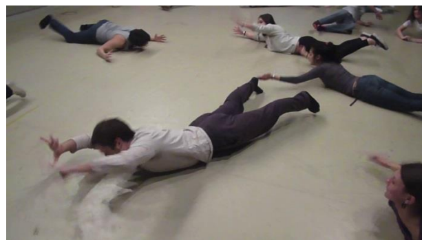
Figure 22 – Variations in space (2013)

A number of choreographic variations were developed. The standard shape of the globe gesture was treated as pure movement pattern. Its formal properties were explored, its expressive potential was investigated and pushed to the very limit (Fig. 20 below). Participants were asked to make the globes “bigger” or “smaller,” higher up or lower down, closer or more distant. The gesture was also performed lying flat on the stomach or on the back, creeping or rolling on the floor; striding, skipping or making small leaps; unstressed or with marked emphasis; regular or enhanced.