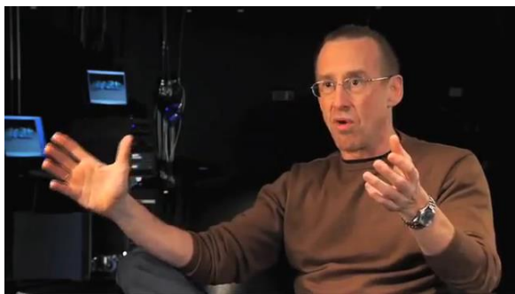
Figure 5 – and turned into ANOTHER VISUAL FORM The globe gesture and its variants: here the “wider globe”

shape may occur, the overall globe configuration is relatively stable.