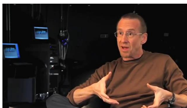
Figure 4 – There’s books that contain facts, LITERATURE ITSELF

The globe has a spectacular quality that is quite unique in the repertoire of abstract gesticulation. An invisible object is “conjointly delimited by gesture and defined by speech” (Calbris 2011: 117). It is typically fashioned with synchronous, mirrored moves of both hands, which are positioned before the speaker and held up in gesture space. The globe thus becomes the locus and focus of joint attention. A fictive frame is manually established that encloses and delimits a single entity or volume. The substance has no actual physical existence but is metaphorically “of substance” to the speaker. It is a transparent and weightless “stuff,” an impalpable “thing.” Yet this “stuff” or “thing” is meaningful and given reality through a powerful act of gestural make-believe . Something invisible is displayed and looked at, something intangible is held and referred to, and a clever semiotic trick performed.