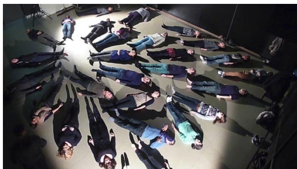
Figure 16 – “Breathe and connect” (2014) Coordinating breathing patterns and developing a sense of co-presence