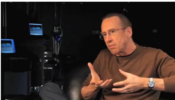
Figure 15 – ... an IDEA THAT PULLS PEOPLE INTO ACTION Globe gesture blends with metaphoric motion towards action

Such “virtuosic” elaborations are creative and powerful forms of “spatialized reasoning” (Calbris 2011: 287), which generate “manipulation-based imagery for abstract content” (Streeck 2009: 152). But most of the time “thinking by hand” (151) is done unconsciously, and the question may be asked whether the kinetic features and symbolic properties of the globe gesture might be put to use to develop a conscious, calculated “manual thinking method” (177) in areas where high degrees of abstraction are commonly experienced as daunting by students.