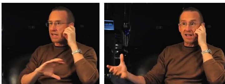
Figure 2 – going from IDEA to ACTION

abundant use of the globe gesture during an interview recorded at the Ohio State University in 2009: 30 times with referent NPs 2 and 3 times with nominalized clauses 3 , in less than 6 minutes devoted to the presentation of “choreographic objects.” Forsythe occasionally resorts to other metaphoric “gestures of the abstract” that give form to content (McNeill 1992: 145) like finger bunches, cup shaped hands, open palms down, open palms vertical and oblique palms. But he does so more sparingly (10 times in all), as these gestures perform different representational functions.