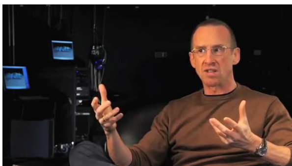
Figure 12 – ... but CHOREOGRAPHY DOES NOT ALWAYS LOOK LIKE A DANCE