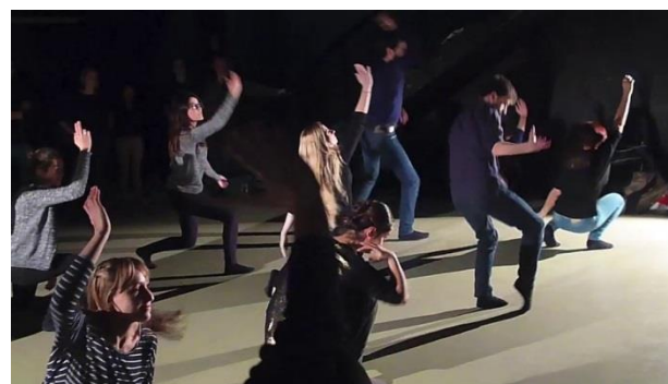
Figure 18 – “Laughing in the face of adversity” (2014) Free variations based on an authentic vocal-gestural sequence 14

Prior to attending the workshops, students are normally asked to make their own selection from the video corpus. They choose “micro-scenes” or “word-gesture capsules” which will later be re-enacted during the group sessions. The gesture sequences provide primary movement material for the choreographic variations on form, energy, orientation, placement, mood and intent that are later developed. Dance theory (Laban 1962) and simple dance composition techniques (Ashley 2005, Burrows 2010) are applied to work on the form, dynamics and expressive impact of bodily moves. Combined with simple drama techniques (Lecoq 1999, Adler 2000), this instructional method allows students to achieve an unusually high degree of mental and physical engagement in the observation and interpretation process. Even shy and self-conscious students eventually find themselves “emboldened by embodiment” (Lindgren & Johnson-Glenberg 2013: 445).