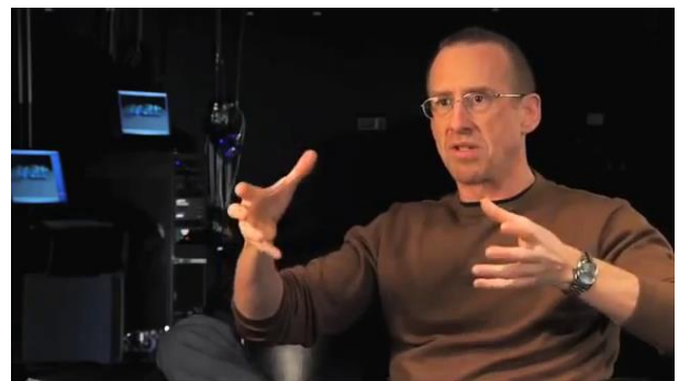
Figure 1 – the dance or THE PROPERTIES OF THE DANCE Standard globe gesture: the referent concept is “entified” and space “given semantic content” (McNeill 1992: 155-56)

An invisible globe is manually shaped that stands for a mental object. A “bounded physical entity” is created that displays “the image of a concept” (McNeill 1992: 145). The referent is named during the process.