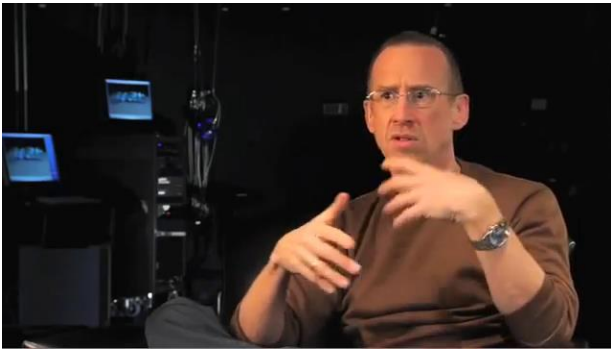
Figure 14 – ... we know about PATTERN EMERGENCE Globe hand configuration blends with spiral move indicating development