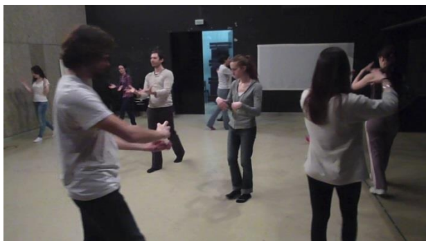
Figure 21 – Metaphor in action: manipulating objects of conception (2013)

The derived nouns instantly acquired a remarkable degree of “palpability” (Talmy 2000: 144) and their meanings were given shape, texture and substance. Once this was done, the globes “dissolved”, as the arms went back to their rest position. Alternatively, the globes were maintained and used as “play material”. When this happened, the entities became choreographic objects in their own right, undergoing a series of physical manipulations, with manual activity standing for mental activity, and choreographic objects for objects of conception.