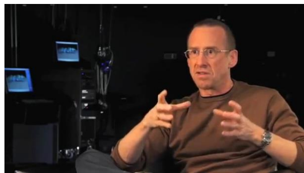
Figure 6 – there's DVDs The upper section of the globe (metaphoric) is flattened and evokes the circular surface of the referent (iconic)

The globe gesture is not tied to a particular semantic category and is not normally iconic of the designated referent 7 , unless some element of shape can blend with the globe (Figure 6) or some other notion or process is brought into the picture, thus creating a multi-layered and multi-dimensional gesture (Figure 7).