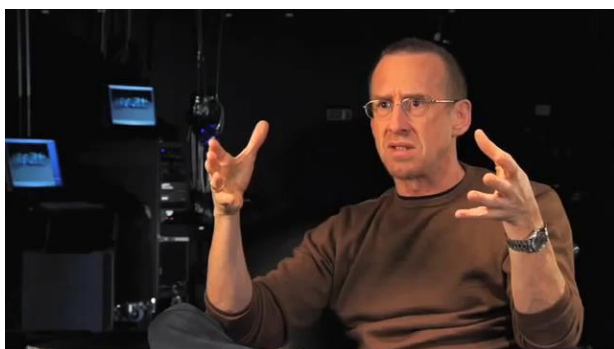
Figure 9 – HOW DO YOU EXPRESS THIS? Globe gesture used with a question

The unifying power of the globe gesture is also activated when reference is made to a clause. This happens only on 4 occasions in the Forsythe (2009) interview: “ How do you express this? ”; “ The dance is the explanation ”; “ We can actually slow it up or speed it down. ” The speaker displays his own objects of inquiry, belief or experience for examination by the listener. The topics are manually presented as things to be considered , i.e. “looked at together” (Lat. considerare ) in the here and now of speech.