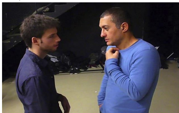
Figure 17 – “The presentation of self” (2014) “I’M NOBODY, WHO ARE YOU? Are you nobody too?” 13 Silent replay: posture, gesture and facial expressions only