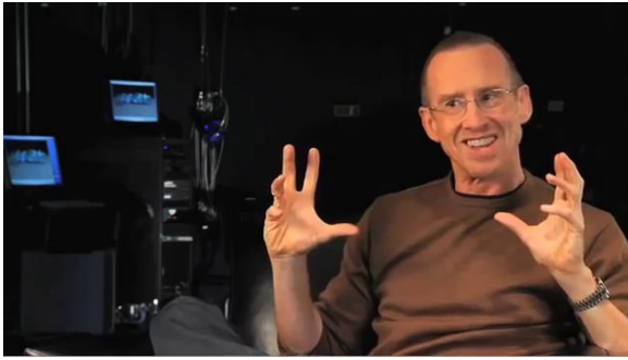
Figure 11 – ... a way of HOLDING TIME A LITTLE MORE STILL Gestural enactment of an “ontological metaphor” Time construed as an “object” made up of “homogeneous substance”

experience and treat them as discrete entities or substances of a uniform kind” (25).