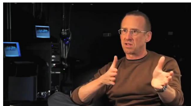
Figure 7 – this is a problem in THE MARGINALIZATION OF DANCE CULTURE The globe / frame is moved outward and shifted to the periphery of the gesture space. A conceptual entity is metaphorically created and an indication of peripheral status iconically marked

Typically, the globe gesture delineates and establishes an object of conception (or experience) that is nominal rather than verbal, phrasal rather than clausal, abstract rather than concrete. Most of the NP heads that occur with the globe gesture are singular