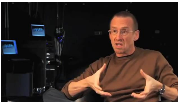
Figure 8 – there’s BOOKS THAT CONTAIN FACTS Creating a sense of unity out of multiple referents

nouns (28), single or compound, which tend to receive an “abstract” or “conceptual” reading (e.g. organization, pattern emergence ). Only a few occur in the plural (9), some with a distinctively “concrete” meaning (e.g. books, installations, graphs ), others prone to a more “notional” understanding (e.g. personality traits ). Interestingly, the reference made to concrete plural nouns tends to be rather vague and general (e.g. dances, choreographies, films, installations ). However, the globe gesture creates a sense of unity and cohesion , as all items seem to be lumped together: