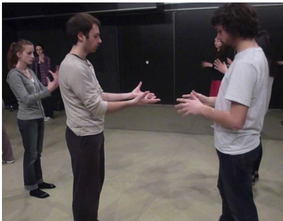
Figure 19 – “Shaping ideas with the globe gesture” (2013) Demonstration of the basic gestural form to participants Choreographer (on the left) uses typical Eng. and Fr. examples

who led the group into physical action. He had been previously briefed on formal issues related to the morphology, semantics and semiotics of gesture. The sequence dedicated to the symbolic properties of the globe gesture lasted approximately 20 minutes.