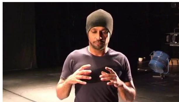
Figure 20 – Original English example “I think this week we started to get A SENSE OF ALL THE SCENES 15 ...”

The globe gesture was first presented through authentic English and French examples, and characterized as a type of gesture typically used to “shape ideas”, while conveying “a sense centrality, wholeness and unity”.