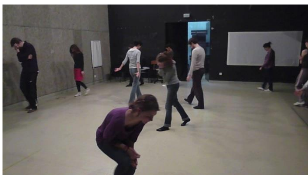
Figure 23 – Sadness (2013) Heads down and drooping posture Globe gesture is unanimously discarded

Iconic depictions are produced that abstract away then display salient features of the referent. Thus, all participants responded to the verbal stimuli toughness , sadness with a variety of frowning and drooping postures, not with hard or limp variants of the globe gesture. Interestingly, the physical enactments of word meanings involved the entire body, not just the hands, unless some emblem was available, as happened when madness was uttered, and translated by short repeated knocks on the head.