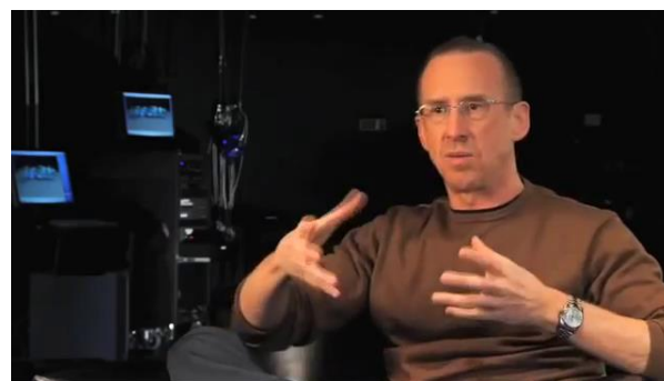
Figure 3 – I’ve done INSTALLATIONS before

The globe has a spectacular quality that is quite unique in the repertoire of abstract gesticulation. An invisible object is “conjointly delimited by gesture and defined by speech” (Calbris 2011: 117). It is typically fashioned with synchronous, mirrored moves of both hands, which are positioned before the speaker and held up in gesture space. The globe thus becomes the locus and focus of joint attention. A fictive frame is manually established that encloses and delimits a single entity or volume. The substance has no actual physical existence but is metaphorically “of substance” to the speaker. It is a transparent and weightless “stuff,” an impalpable “thing.” Yet this “stuff” or “thing” is meaningful and given reality through a powerful act of gestural make-believe . Something invisible is displayed and looked at, something intangible is held and referred to, and a clever semiotic trick performed.