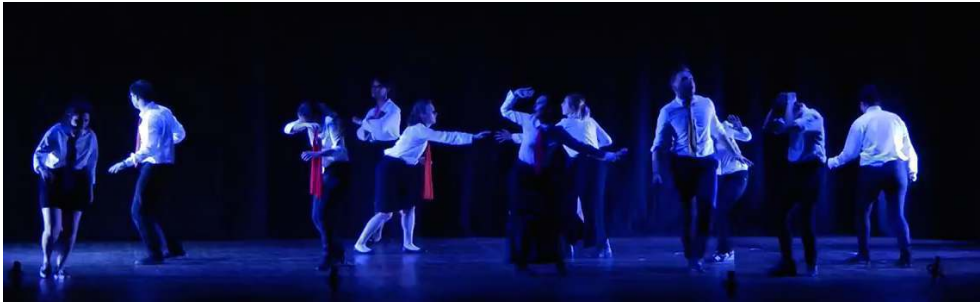
Part 2 – “C’est la guerre!”