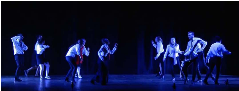
Part 2 – “The War!”