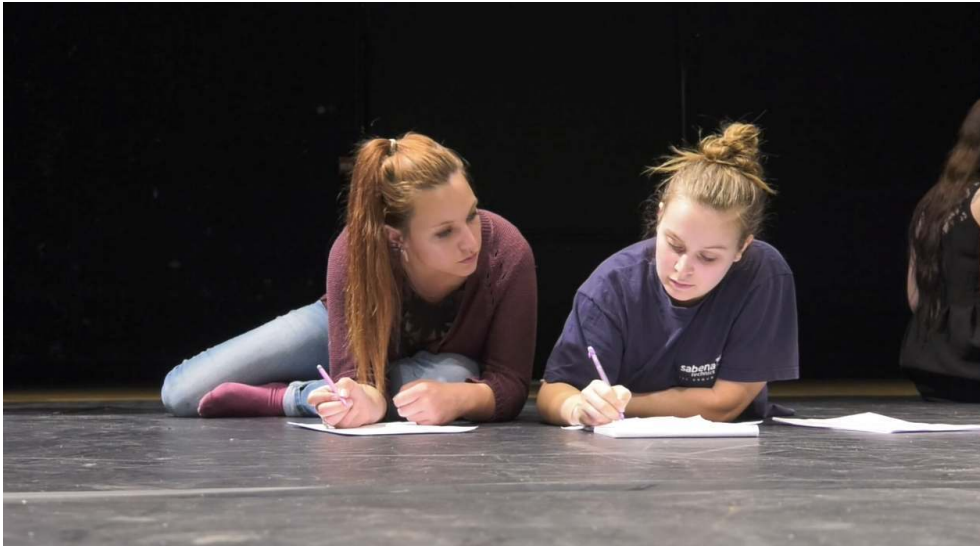
WORKING ON THE SCRIPT