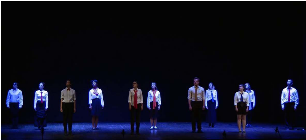
PART 1 – “BUT WHAT HAVE I DONE WITH MY LIFE?”