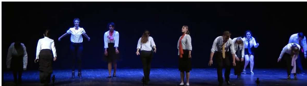
BREAKING THE WAVES: SEA AND LIGHTHOUSE MOVEMENTS