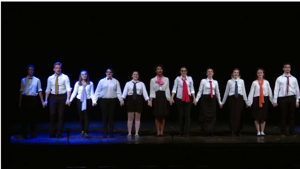
CHOREOGRAPHERS OF SPEECH