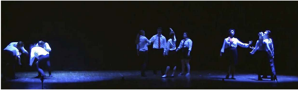
PART 3 –MR RAMSAY / LILY BRISCOE / MRS RAMSAY