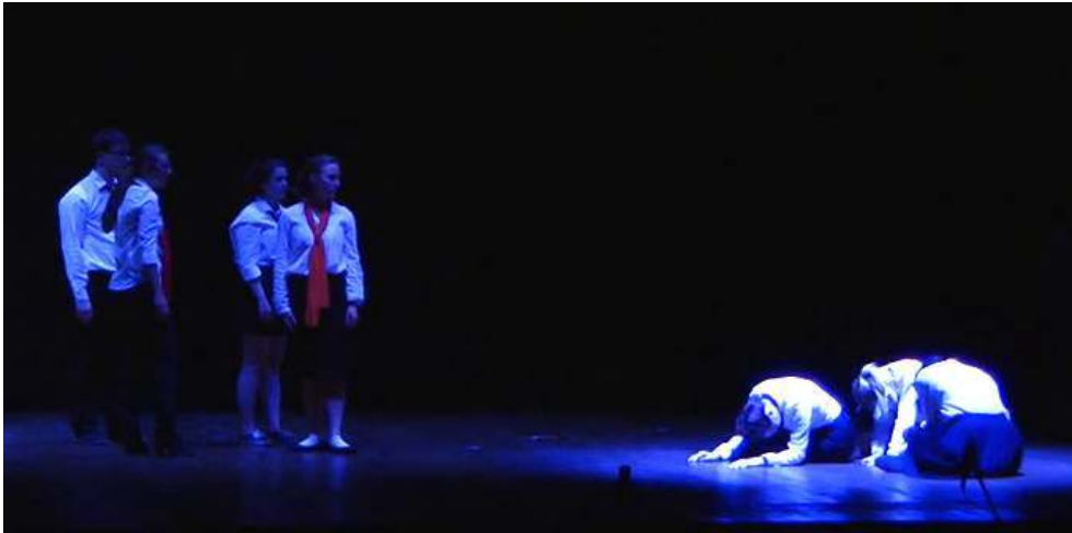
PART 3 – “MRS RAMSAY HAS FADED AND GONE”