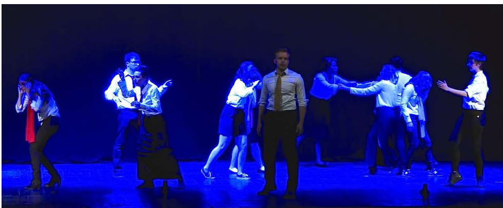
PART 2 – “BUT WHAT AFTER ALL IS ONE NIGHT?”