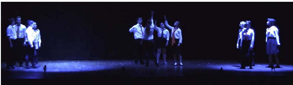
PART 3 –“LILY NEVER FINISHED THAT PICTURE.”