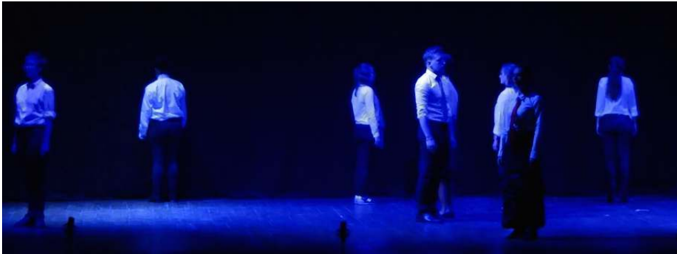
Part 2 – “Darkness. Nothing stirred, nothing moved.”