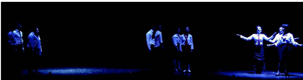
PART 3 – “MRS RAMSAY RESOLVED EVERYTHING INTO SIMPLICITY.”