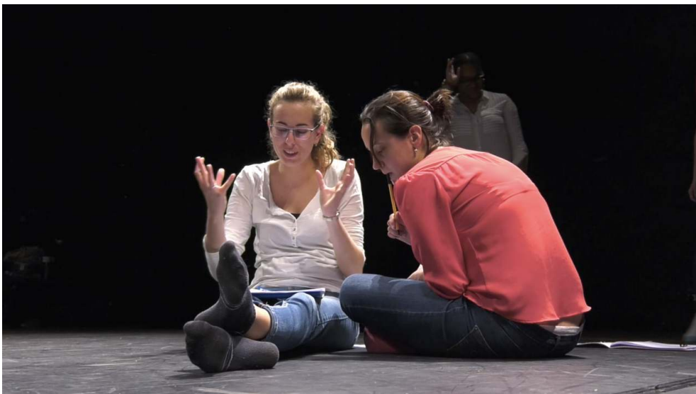
REFLECTING ON GESTURE FORM