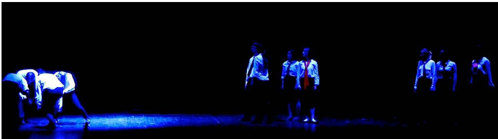
Part 3 – “That man never gave. That man took!”