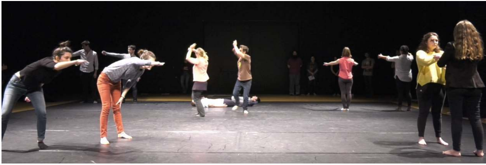
EXPERIMENTING WITH SHORT GESTURE SEQUENCES