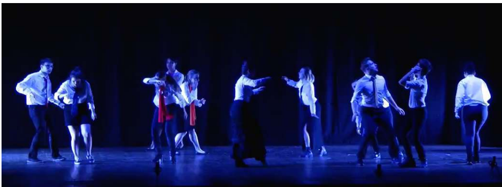
PART 2 – “DER KRIEG!”