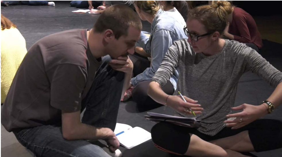
SELECTING MOVEMENT MATERIAL