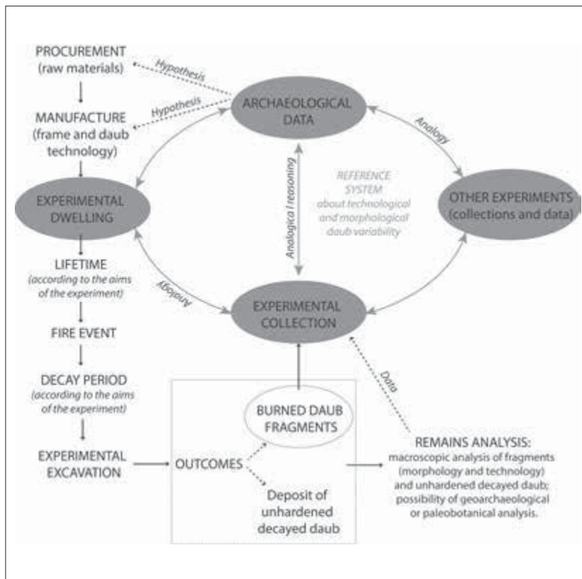
Figure 4. Different steps of the experimental protocol, according to the aim of the project.

the other hand, issues regarding the lifespan of the dwelling and the decay processes require long experimental procedures (in terms of time, at least months or years) and are extremely variable. Furthermore, firing dynamics for the models can be too different from the full-scale ones, so at this moment it is hard to find answers for this topic. Experiments with models can be complete in term of technological and morphological analyses of the structure, but data on fire dynamics and conservation of remains are just approximate.