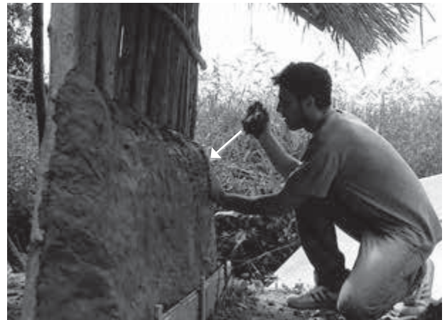
Figure 6. Recording the hand movements during the placing of the daub.