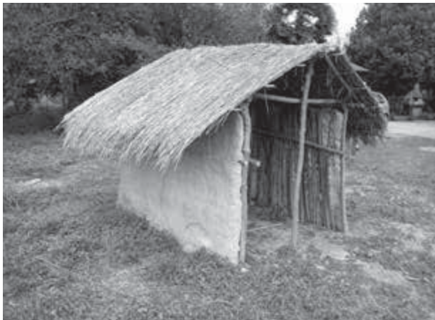
Figure 5. Experimental model after its realization, waiting for the fire event.