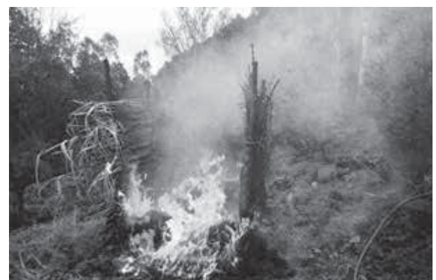
Figure 3. Experimental model exposed to a final fire event.

But how is it possible to test the variety of building techniques? The experimentation on new real scale buildings can give very complete and accurate data, but it takes a lot of time and resources. Moreover, dwellings in Archaeological Open Air Museums or other real scale buildings are rarely constructed to be burned, except in exceptional cases of accidental burning or experimental projects focused on burned buildings (i.e. Apel et al. 1997; Bankoff, Winter 1979; Cavulli, Gheorghiu 2008; Gheorghiu 2005; Rasmussen 2007; Shaffer 1993; Tipper 2012). In order to obtain a large amount of information, for our set of