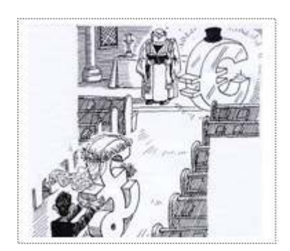
Figure 1. "Nearer to the altar" in The Economist Feb 27th - March 5th 1999

Eight<sup>1</sup> weeks after the successful launch of the Euro – the common European currency – Tony Blair pledged that he would speed up the process of monetary union. In the editor's own words, this amounted to "prodding the British a little more quickly up the monetary aisle."