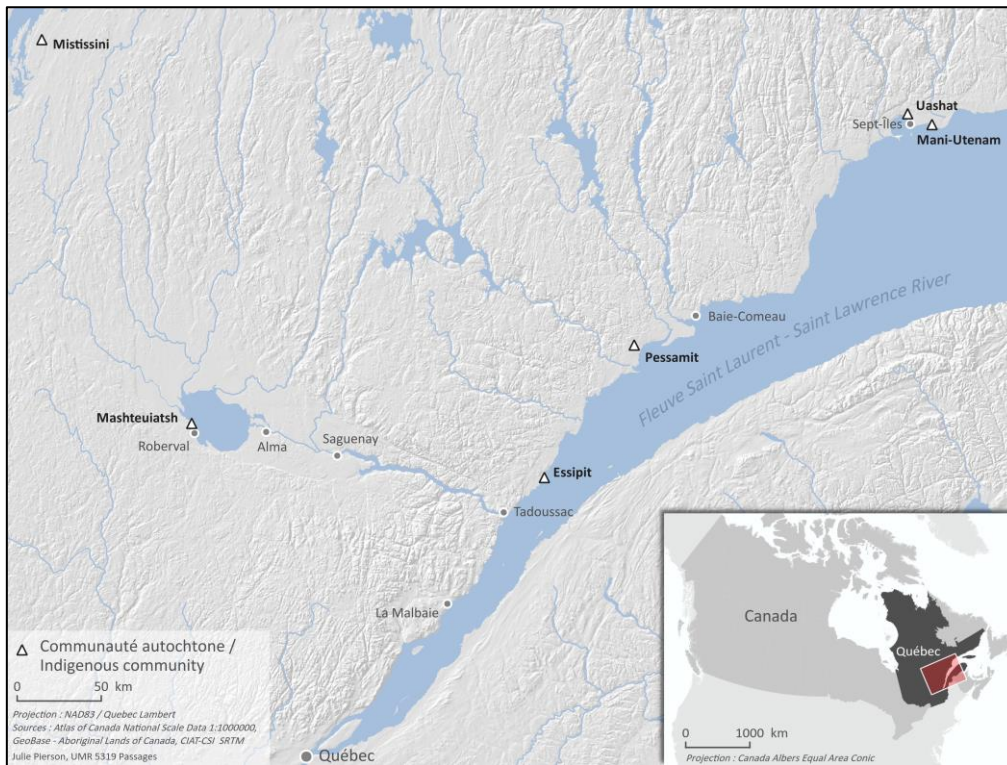
Map 1: Location of Mashteuiatsh