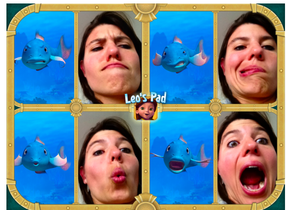
Figure 3. Using pictures to create engaging game dynamics

If a learner's profile is created, however, a profile picture will make it more personal. Also, taking pictures of children within a game can be a fun and engaging activity (Figure 3). Insights from games played by learners show up in an accompanying parent app, usually installed on the parents' phone, while the game is played on a tablet. Kidaptive's approach of local storage means pictures cannot automatically move from the game on the tablet to the parent app on a phone or vice versa. This is in contrast with user friendliness when parents expect that when they upload a profile picture for a child in the game on a tablet, that picture will also show in the accompanying parent app learner mosaic on their phones. Or when they expect the pictures made during gameplay on the tablet will show up in their parent app.