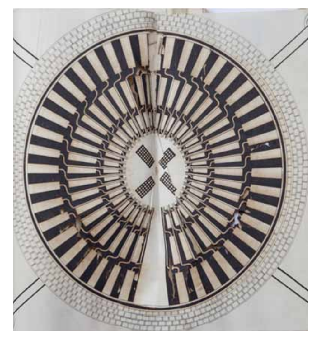
BFI OW RIVAYAT OF DASTUR DARAB HORMAZDYAR WITH LAYOUT OF THE THREE SETS OF PAVIS IN A MEHERJIRANA LIBRARY, NAVSARI

Final TOC Book 2-5-16 N.indd 293 05/05/16 3:42 pm