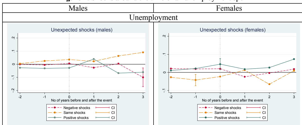
Figure 2. Shocks around the time of an unemployment spell

Notes. The sample contains individuals less than 55 years of age. The shock variable in t is constructed as the difference between reported health transition between t-1 and t and expectations reported in t-1 . Individuals observed 3 years or more before unemployment serve as the reference category. Confidence intervals (at the 10% level) are represented only when the coefficient is statistically significant.