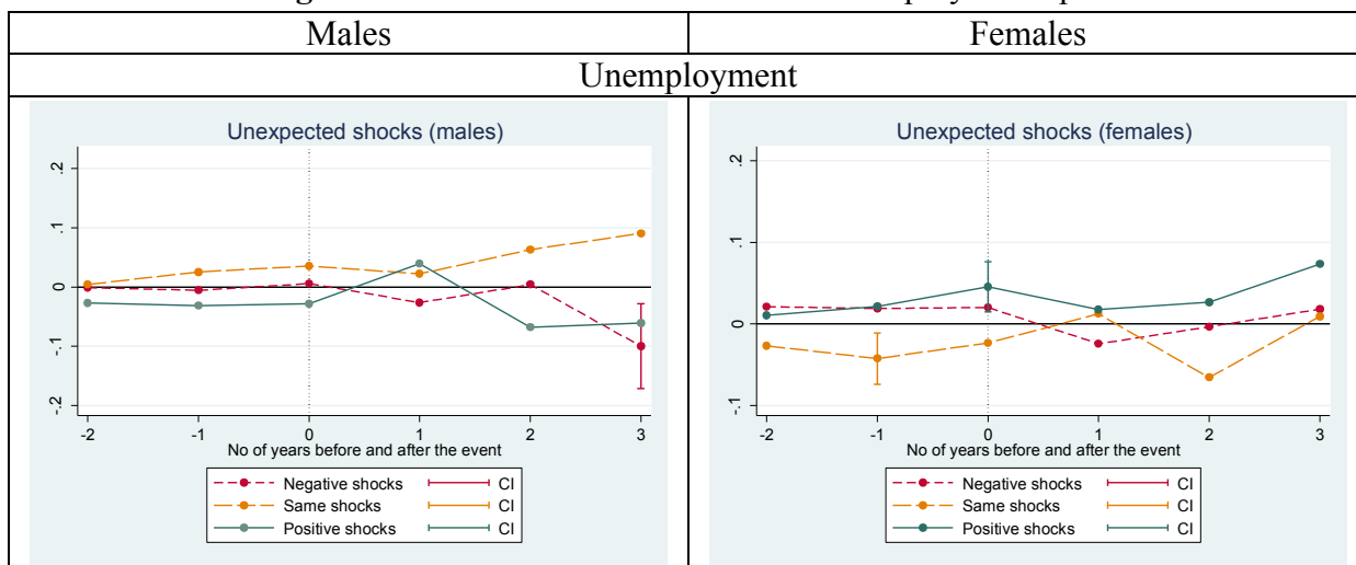
Figure 2. Shocks around the time of an unemployment spell

Notes. The sample contains individuals less than 55 years of age. The shock variable in t is constructed as the difference between reported health transition between t-1 and t and expectations reported in t-1 . Individuals observed 3 years or more before unemployment serve as the reference category. Confidence intervals (at the 10% level) are represented only when the coefficient is statistically significant.