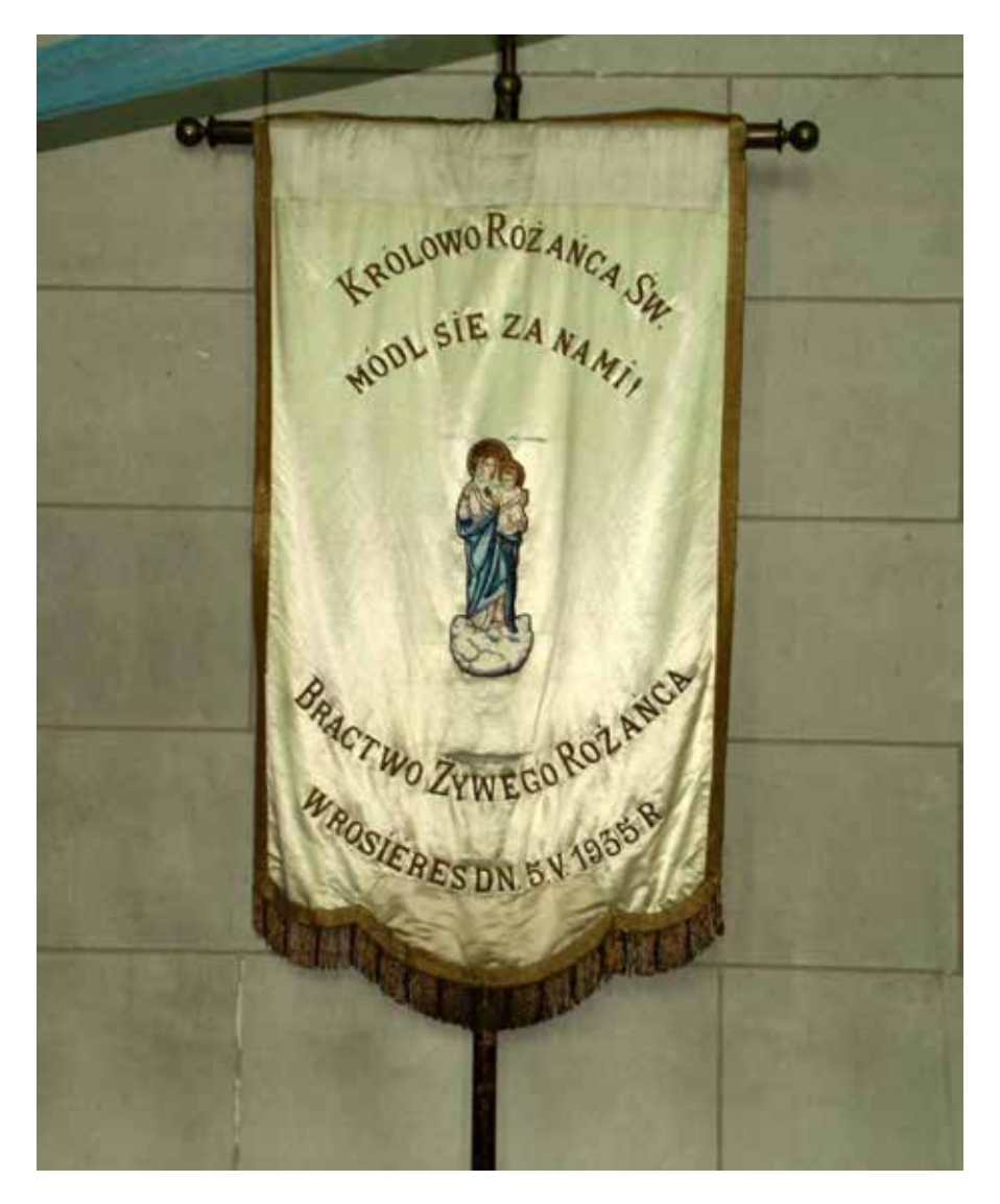
Fig. 4. Banner of the Rosières' Poles, 1935, exhibited in the church.

personalities like the mayor also contributes to publicly recognizing the event. A husband and wife who both worked at the factory notice: