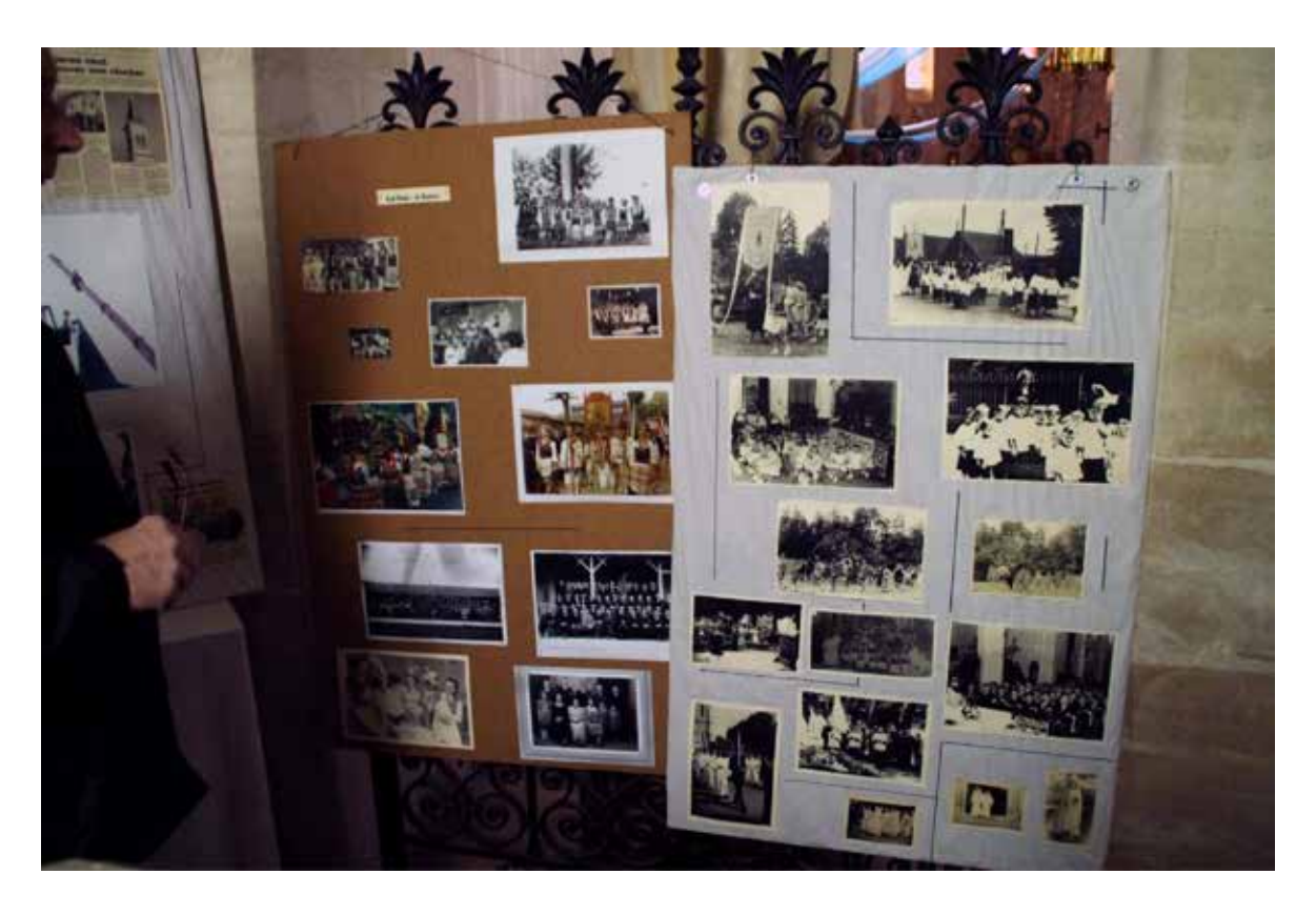
Fig. 1. Exhibition about the history of Rosières and the church, inside the church. On the left panel, the Polish choir in the late 1960s. G. Etienne, 2015