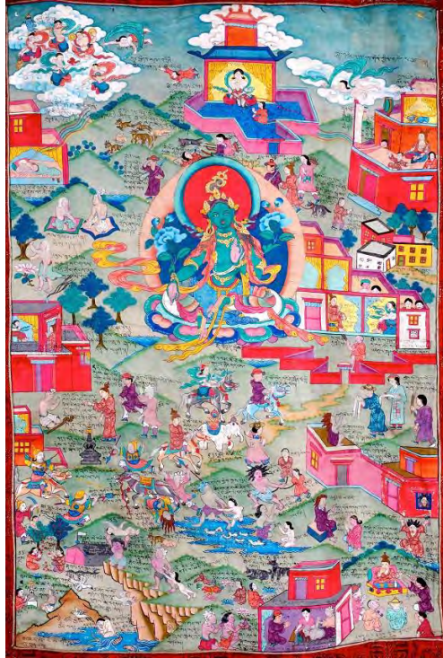
Fig. 6a — A Thangka illustrating the story of Drowa Zangmo painted by Sonam Angdu (early 21st century).

meaning of these scenes and give the name of the characters (Fig. 6a and 6b).