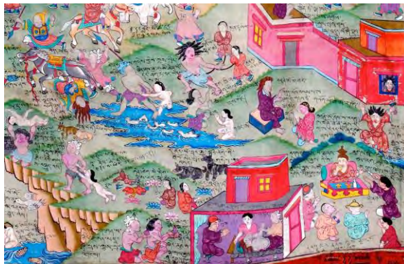
Fig. 6b — A Thangka illustrating the story of Drowa Zangmo painted by Sonam Angdu (early 21st century) – detail.