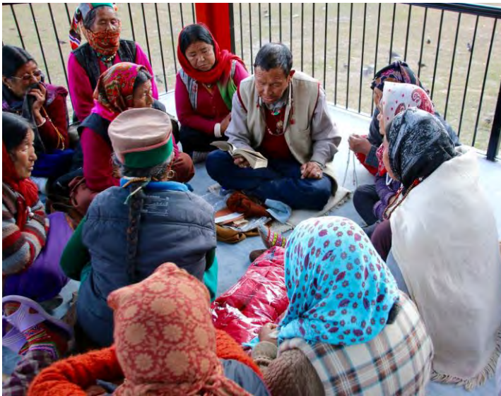
Fig. 4 — The Onba from Khar village reading the story of Pema Öbar to Pilgrims in Tsopema (Mandi).