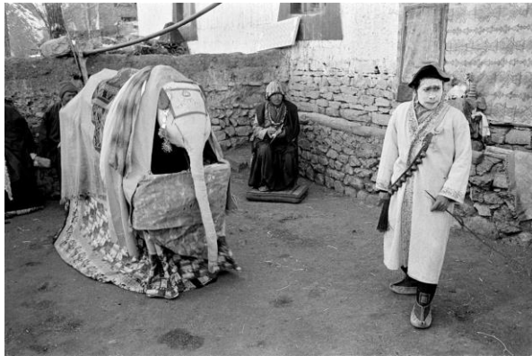
Fig. 7. A performance of Drime Künden in Lara (Feb. 2004).

they acted out three 'dramas': Lingza Chökyit and her travels into the Hells; the Prince Drime Künden; and one play featuring a royal wedding, probably that of the Tibetan King Srong btsan sgam po with two princesses, one from China and one from Nepal (Fig. 7).