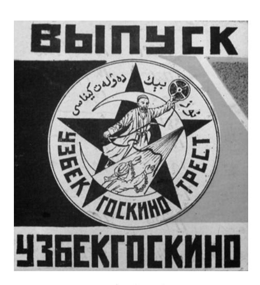
Logo of Uzbegoskino

progress' (the film). But the issue is not sure: will he catch it or not? Whether he will continue to follow the (divine?) light<sup>20</sup> or will he jump out of this ray? The idea of liberation is also stressed by the fact that the 'modern' Muslim shows his eyes. He seems clever, acting consciously and ready for confrontation. The star, with its five points, shines around inescapably while the crescent, close to a perfect circle, symbolises endless repetition, confinement and blindness. The idea of blindness is also given by the fact that the eyes of the 'old-fashioned' Muslim are not seen. A sense of superiority is created by the vertical composition: the message enclosed in the film-roll is superior to the light itself, the 'modern' man is superior to the 'old-fashioned' one. The verticality, often used in propaganda, insists on a dichotomy between paradise and hell and inverts the religious message. Here religion, which usually leads one to paradise, is subservient to the progressive medium. Film is the means for liberation, it interferes with the light (at the meeting point of the crescent and the red star), which however provides the necessary