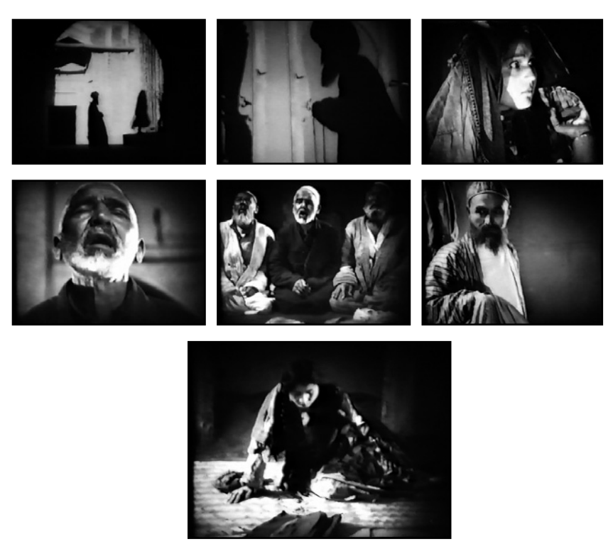
Zikr and rape, The Fiancée of the Ishan

He makes one of his disciples bring the woman to him for consultation, and then sexually abuses her. <sup>61</sup> The scene of violence is not shown directly. It is suggested by images of Sufis in an ecstatic state, doing a zikr . Their faces are shown in close-up, with faster and faster editing giving the scene. The film juxtaposes practices of zikr and spiritual ecstasy with those of rape and sexual pleasure.