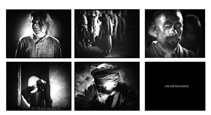
"Religion, a lie" film stills, The Fiancée of the Ishan

If sexual abuse was used to delegitimise religious authorities, in the case of Ismailism, the economic and capitalist abuses were used to