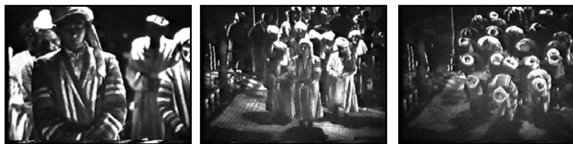
The filmmaker at the collective prayer, Ramazan

punctuated the film. The filmmaker conspicuously engaged in anti-religious propaganda also had a small but symbolic role in his movie. He appeared in a scene, where he stood in front of a wide mass of worshippers and initiated the first movements of the collective prayer. Ironically, he made an anti-religious film in which he represented himself praying.