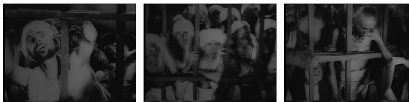
The Living God

The filmic rhetoric of The Emigrant was particularly smooth, but in other cases images were aggressive and risked being counterproductive. They could incite anger, indifference, or just make the spectator leave the cinema-theatre. This point was noticeably raised by Sultan Galiev, who quoted a case in Tatarstan, where a Bolshevik (mispronounced as bul'shaumik ) came to a Tatar village to make an anti-religious action. He stepped on the Qur'an shouting “Look, nothing happened to me! That means that this book is not holy, so Allah does not exist.” Sultan Galiev concluded that actions like this one could only breed anger. 73 These kinds of images existed in anti-religious films made in Central Asia: destroying Orthodox bells ( Her Right ) or portraying Aga Khan and his devotees in a very negative light ( The Living God ).