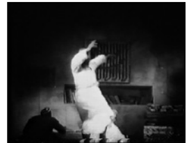
Drunkenness in a mosque, Ramazan

Could such a scene of drunkenness in a holy place be voluntary excessive in order to provoke the opposite sentiment? This ‘presumption of propaganda sabotage’ can be reinforced by some other ambiguities that