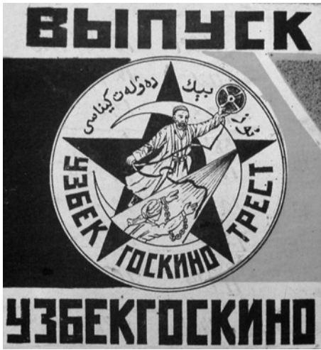
Logo of Uzbekgoskino

progress' (the film). But the issue is not sure: will he catch it or not? Whether he will continue to follow the (divine?) light 20 or will he jump out of this ray? The idea of liberation is also stressed by the fact that the 'modern' Muslim shows his eyes. He seems clever, acting consciously and ready for confrontation. The star, with its five points, shines around inescapably while the crescent, close to a perfect circle, symbolises endless repetition, confinement and blindness. The idea of blindness is also given by the fact that the eyes of the 'old-fashioned' Muslim are not seen. A sense of superiority is created by the vertical composition: the message enclosed in the film-roll is superior to the light itself, the 'modern' man is superior to the 'old-fashioned' one. The verticality, often used in propaganda, insists on a dichotomy between paradise and hell and inverts the religious message. Here religion, which usually leads one to paradise, is subservient to the progressive medium. Film is the means for liberation, it interferes with the light (at the meeting point of the crescent and the red star), which however provides the necessary