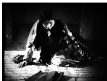
Zikr and rape, The Fiancée of the Ishan

If the intention of the film director was clear, it is more difficult to find out whether the cross-cutting between spiritual ecstasy and sexual vio-