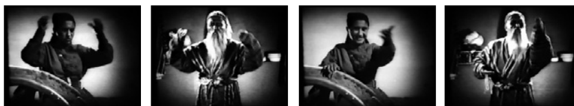
Parallels between the Communist and the ishan , The Fiancée of the Ishan

ods of communication of religious type. 77 The representation of religion and Bolshevik power operated on very simple oppositions: the club was opposed to the mosque, the secular order (militia, court) was opposed to spiritual authorities (mullah, ishan , qadis ). Factories or clubs became new places of salvation. This dichotomy could be found in almost all the films produced in Uzbekistan. But, in contrast to the films made by native filmmakers, the films made by Russians tended to sacralise Soviet power. The first talking movie produced in Uzbekistan, The Oath by Usoltsev-Garf (Uzbekistan, 1937), was the most emblematic