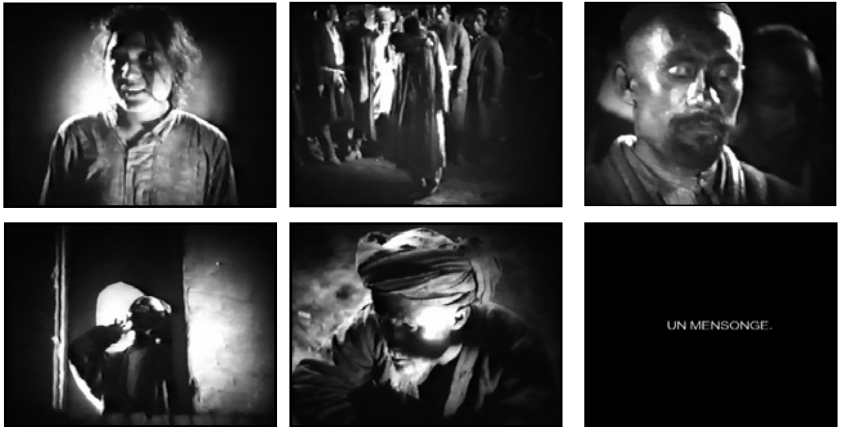
“Religion, a lie” film stills, The Fiancée of the Ishan

If sexual abuse was used to delegitimise religious authorities, in the case of Ismailism, the economic and capitalist abuses were used to