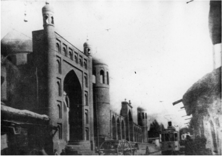
Shaykhantaur Madrasa turned into film studio, 1930.

film-studios Sharq Yulduzi were located within the mosque Ishankul in Shaykhantaur Madrasa 29 in Tashkent and would remain there for more than forty years. According to a decree of the Central Executive Committee and the Council of People's Commissars taken on 22 December, 1926, buildings were withdrawn from waqf administration and given to Uzbekgoskino. 30