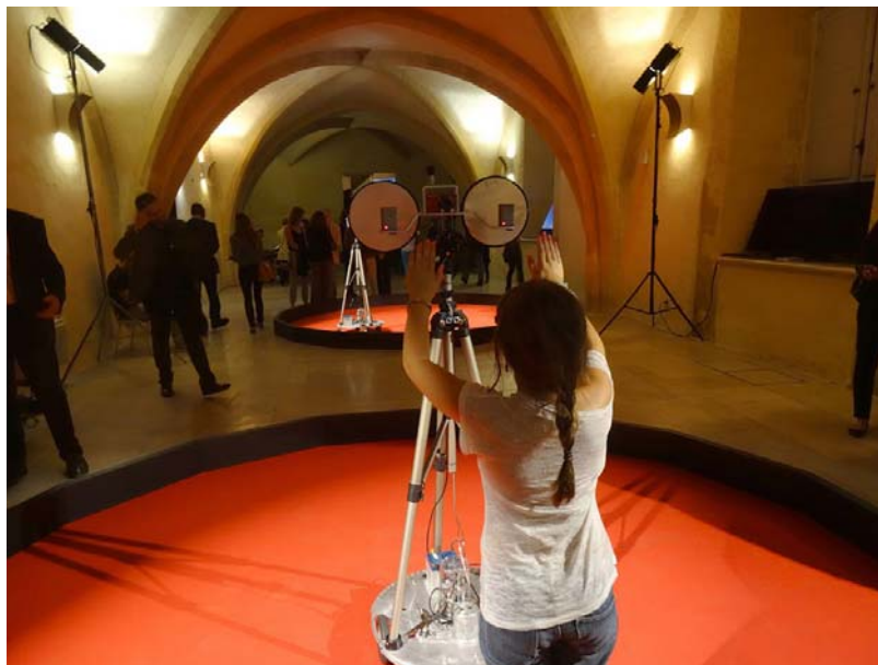
Ken Rinaldo, Paparazzi bot, exposition antiAtlas des frontières, Musée des Tapisseries, Aix-en-Provence, 2013