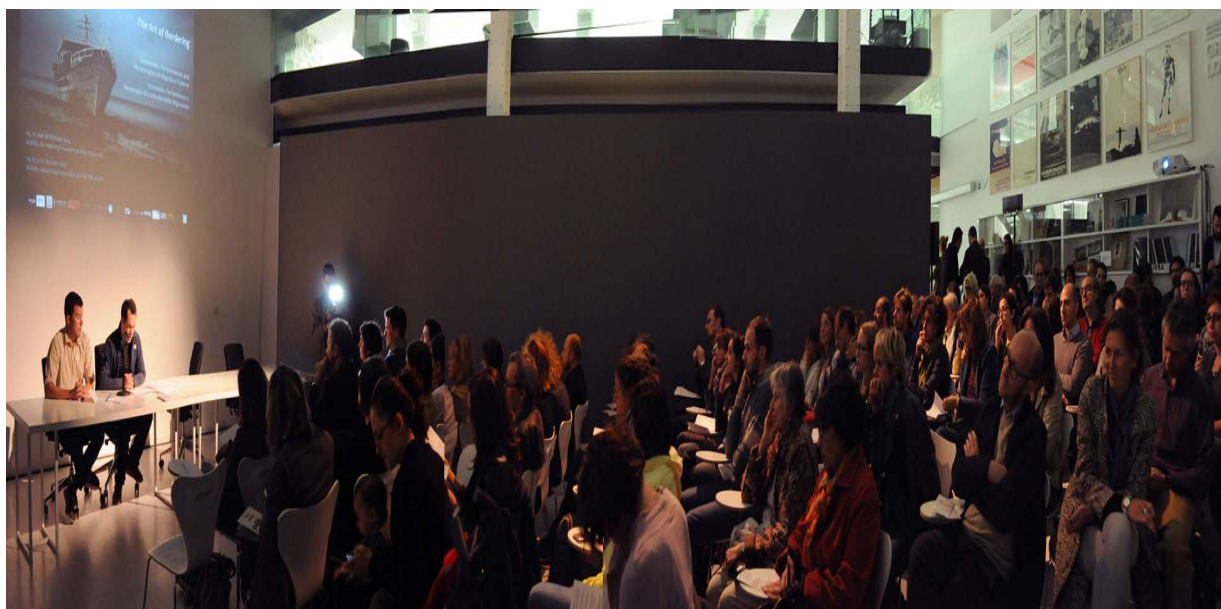
Colloque-exposition The Art of Bordering, Maxxi, Rome, 2014