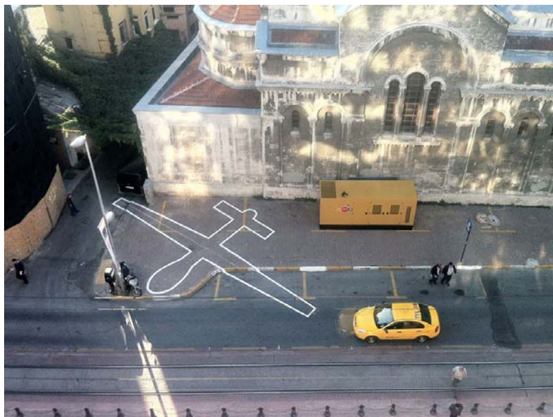
James Bridle et Einar Sneve Martinussen, Drone Shadow 002, Istanbul, Turquie, 2012. Peinture blanche de signalisation des routes, 15 x 9 m.