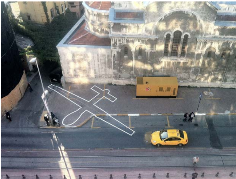
James Bridle et Einar Sneve Martinussen, Drone Shadow 002, Istanbul, Turquie, 2012. Peinture blanche de signalisation des routes, 15 x 9 m.