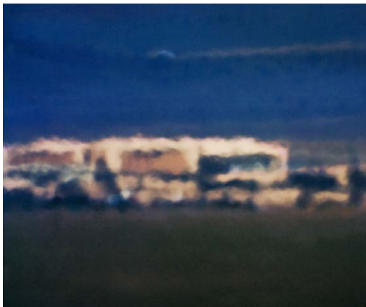
Trevor Paglen, Open Hangar; Cactus Flats, NV; Distance ~ 18 miles; 10:04 a.m., 2007