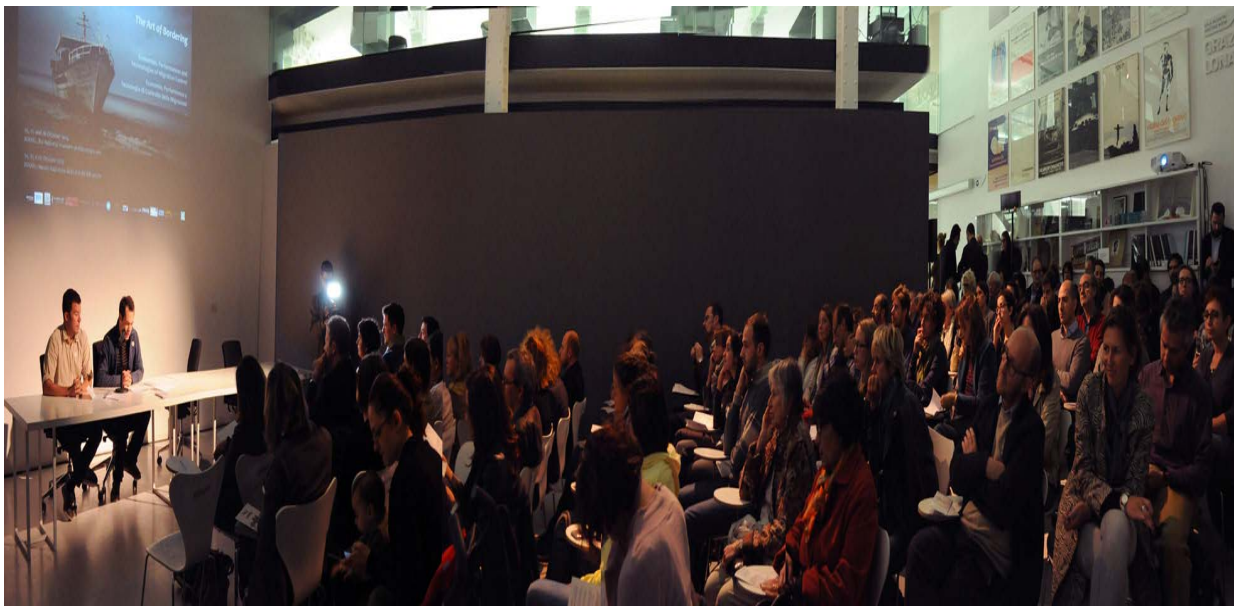
Colloque-exposition The Art of Bordering, Maxxi, Rome, 2014