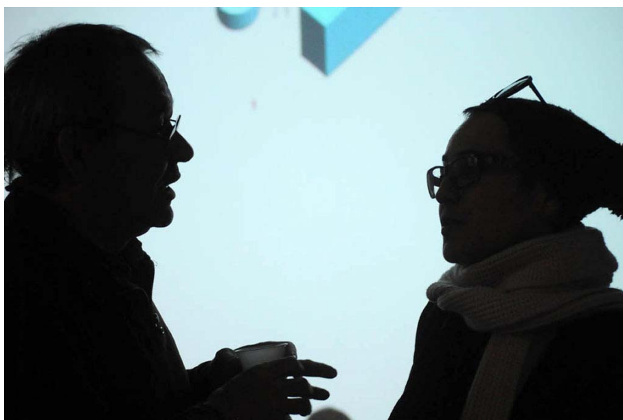
Exposition antiAtlas des frontières #2, La Compagnie, Marseille, 2014