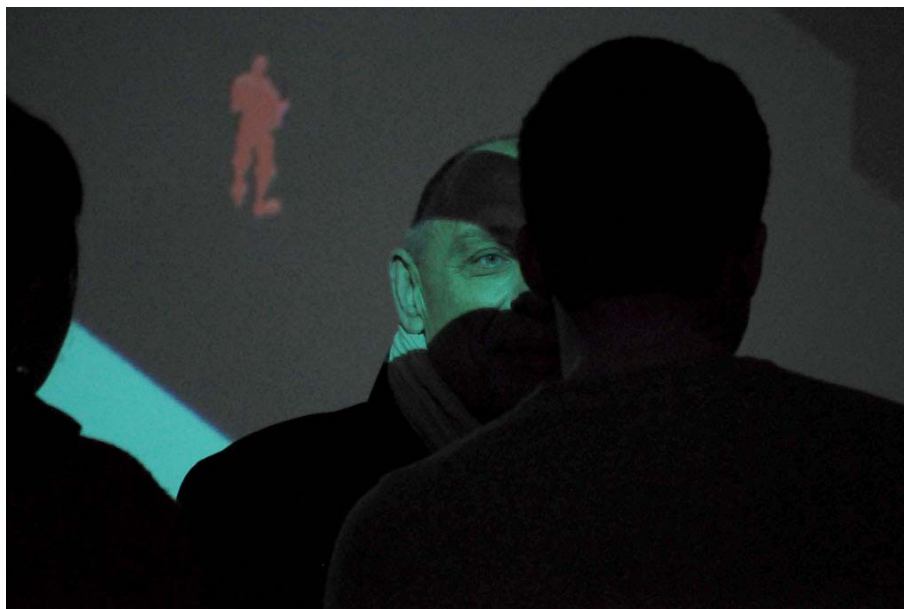
Exposition antiAtlas des frontières #2, La Compagnie, Marseille, 2014, photographie Myriam Boyer