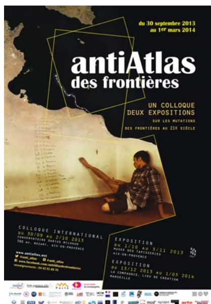
Affiche colloque et exposition antiAtlas des frontières, Aix-en-Provence 2013, conception graphique Myriam Boyer, d'après les travaux de Alberto Campi et Forensic Oceanography.