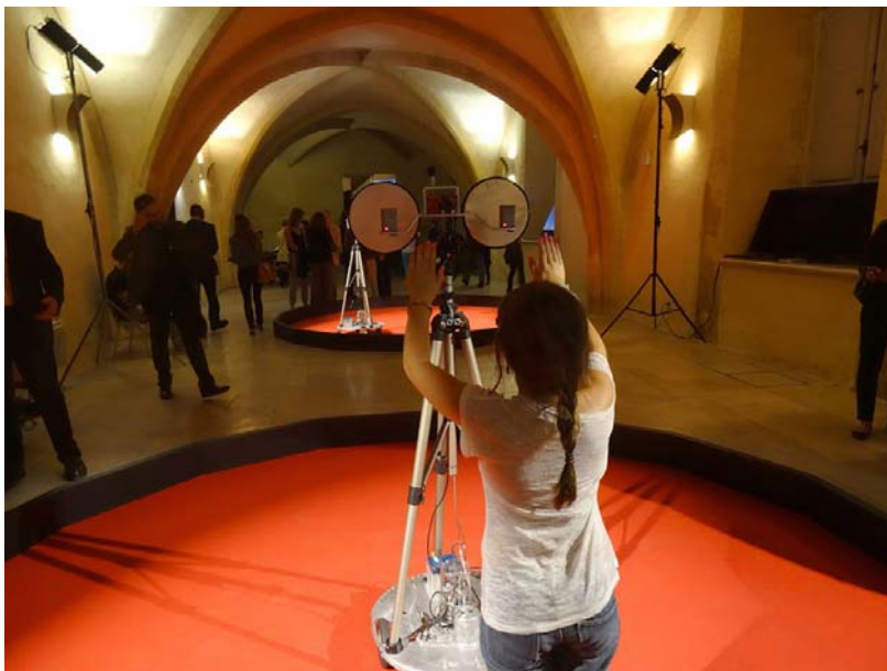
Ken Rinaldo, Paparazzi bot, exposition antiAtlas des frontières, Musée des Tapisseries, Aix-en-Provence, 2013