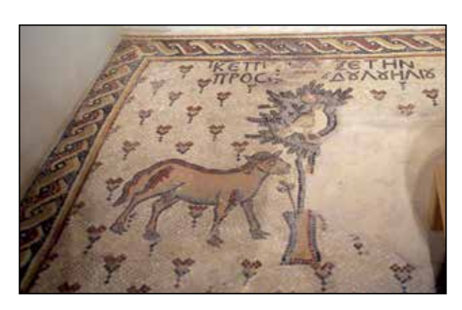
7. Mosaic dedication from Kfayr Abu Sarbut church (al-Khattabiyya), near Madaba, Byzantine period.

Elias was one of the most popular names in the Madaba region and in the whole Near East during the Byzantine period. See above, no 2.