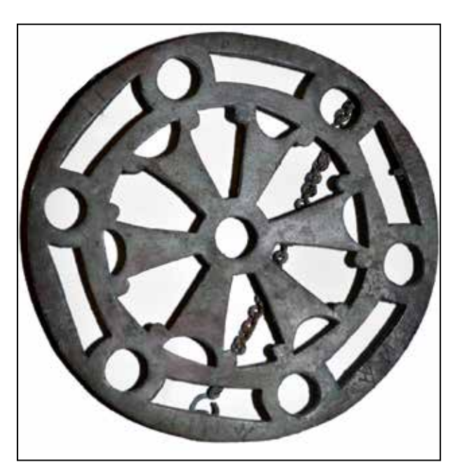
8. Christian Inocation addressed to Saint Sergios on a polycandelon, from Umm ar-Rasas, ancient Kastron Mephaa, Byzantine period.

This object belongs to a well-known series of lamp-bearers, common in Near Eastern Byzantine churches. The so-called 'church of the rivers', where it was discovered, must have been dedicated to Saint Sergios. The cult of Saint Sergios, martyr in Sergiopolis (Resafa in Syria), was widespread in the Byzantine provinces of Arabia and Syria. Thomas donated the object.