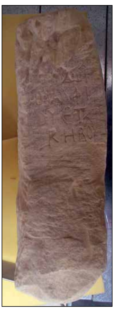
10. Epitaph of Theodoros, son of Alphios, from Petra region, ca 2nd / 3rd century AD.

The Greek name Theodoros is as common in