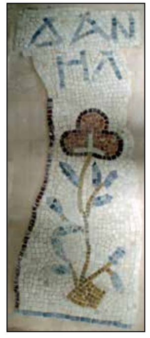
3. Mosaic from Khirbat Daraiyya church, Byzantine period.