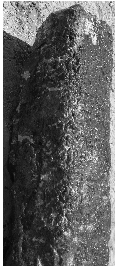
Figure 3. Milestone no. 1, DoA Mafraq (inv. 197): right side © J. Aliquot.

At some distance south of al-Hussayniyya, the environs of the hill where the small Roman fort of al-Qihati stands have yielded no less than a dozen of milestones. All those which were readable are Tetrarchic in date 4 . Like ours, two of them date from 305-306 AD and have similar wording 5 . Other formulae also appear on contemporary milestones in Northern Jordan 6 .