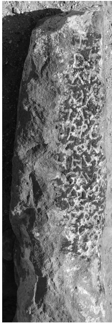
Figure 2. Milestone no. 1, DoA Mafraq (inv. 197): left side