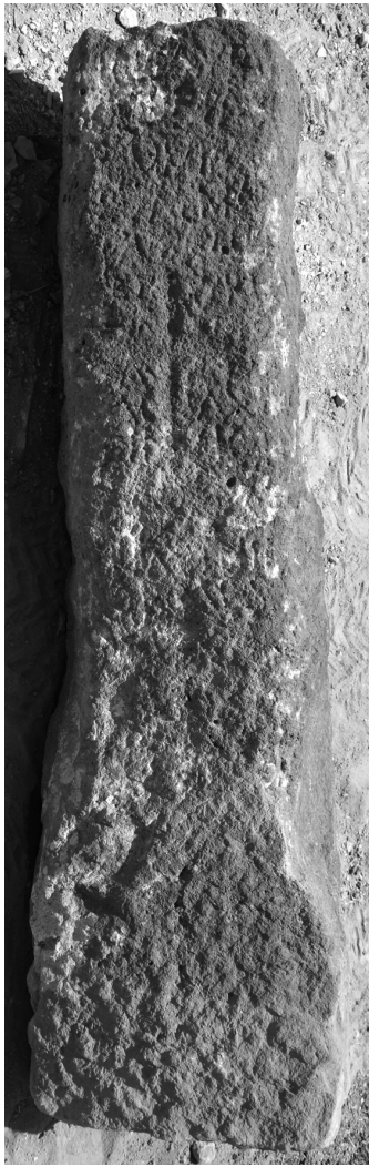
Figure 1. Milestone no. 1, DoA Mafraq (inv. 197): front © J. Aliquot.