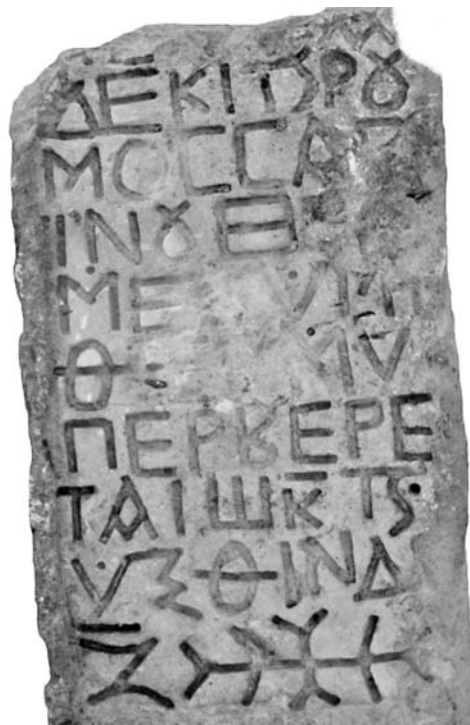
Fig. 8. Christian epitaph of Roumos, from Mu'tah or its surroundings (no. 7)