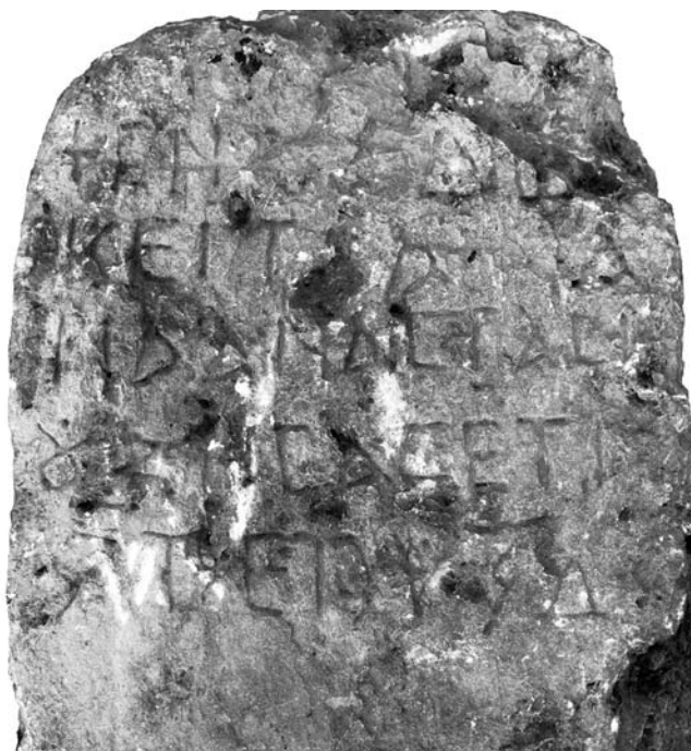
Fig. 5. Christian epitaph of Maria, from 'Azrā (no. 4)