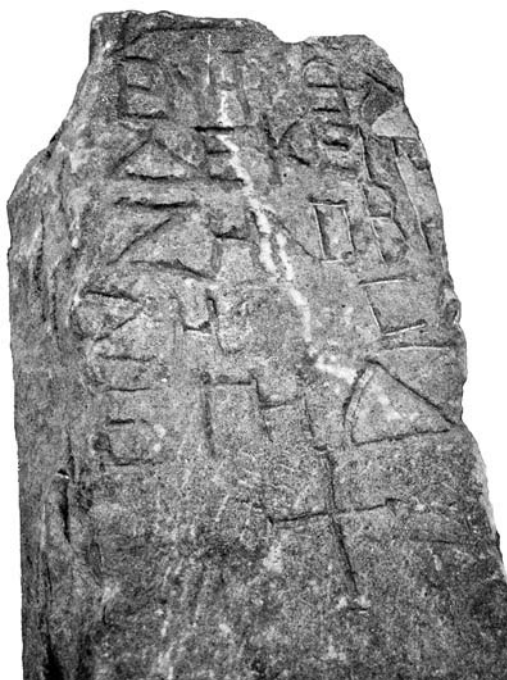
Fig. 4. Christian epitaph of Zenobios, from 'Azrā (no. 3)