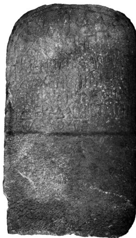
Fig. 3. Christian funerary epigram of Zenobia, from 'Azrā (no. 2)