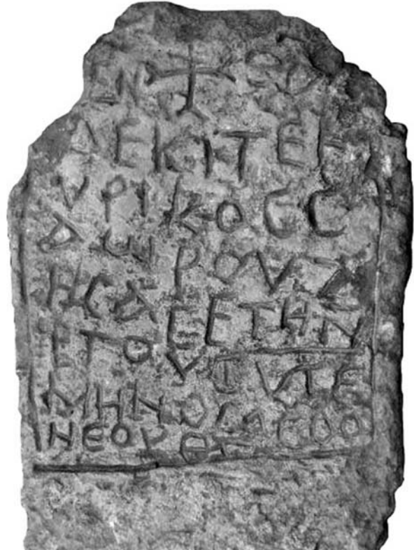
Fig. 7. Christian epitaph of Kyrikos, from Mu'tah or its surroundings (no. 6)