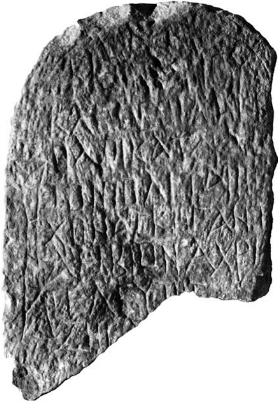
Fig. 6. Christian funerary epigram, from 'Azrā (no. 5)