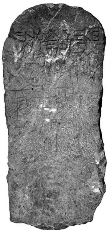
Fig. 2. Epitaph of Georgios and Anastasios, from 'Azrā (no. 1)