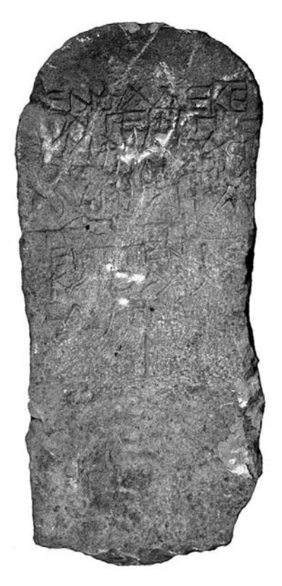
Fig. 2. Epitaph of Georgios and Anastasios, from 'Azrā (no. 1)