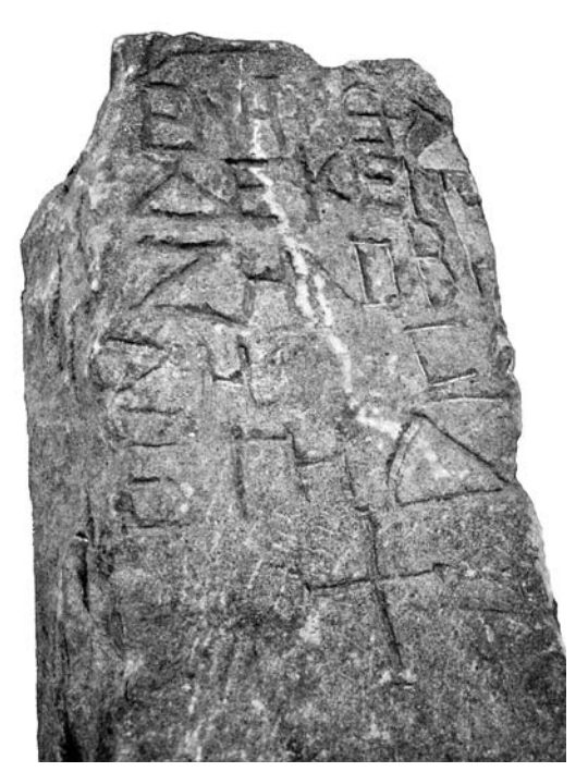
Fig. 4. Christian epitaph of Zenobios, from 'Azrā (no. 3)