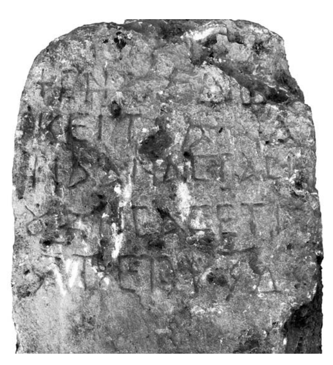
Fig. 5. Christian epitaph of Maria, from 'Azrā (no. 4)