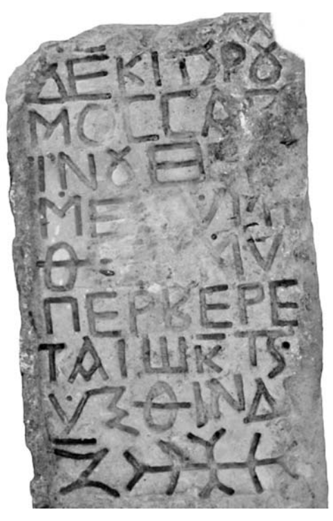
Fig. 8. Christian epitaph of Roumos, from Mu'tah or its surroundings (no. 7)