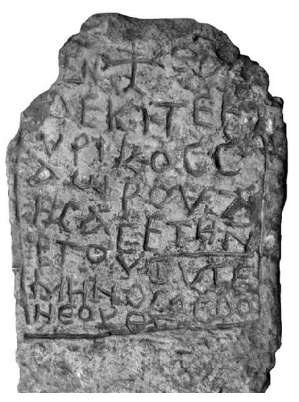
Fig. 7. Christian epitaph of Kyrikos, from Mu'tah or its surroundings (no. 6)