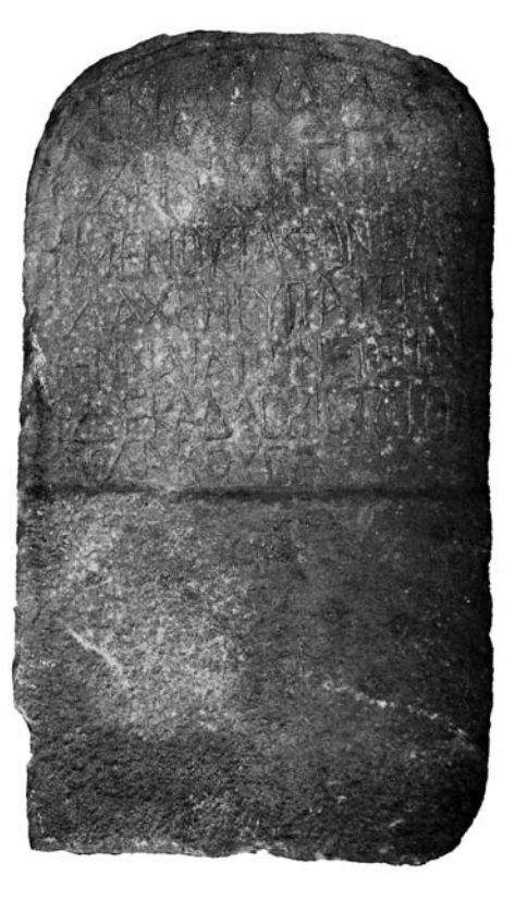
Fig. 3. Christian funerary epigram of Zenobia, from 'Azr \bar{a} (no. 2)