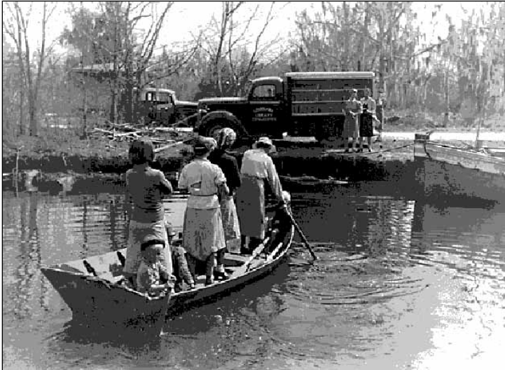
Figure 4 – Lee Rodney. Border Bookmobile , c. 2010