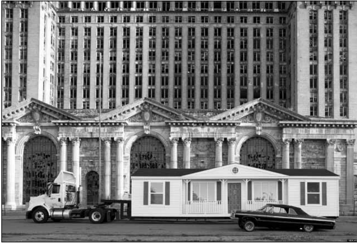
Figure 1 – Mike Kelley. Mobile Homestead , 2010.

Kelley's mobile architecture performs cartographically, initially by linking suburb to city center: the horizontally-oriented, one-story, white-painted structure with adjoining garage that was at home in the suburbs will become a stranger in town. Travelling through the city, this typical post-war house clashes, architecturally speaking, with Detroit's skyscrapers, apartment buildings, factories, and older housing stock. Also, Kelley's itinerary deliberately thrust the house in front of key automobile industry locales, including the historical themeparks started by Henry Ford himself to inscribe his automobile industry in a heroic lineage of American inventors and political figures. And so, when one material fragment of the city is (symbolically) extracted from its assigned location and serially re-positioned with each street-by-street phase of the ensuing journey, the spatial and semiotic organization of the city is shifted.