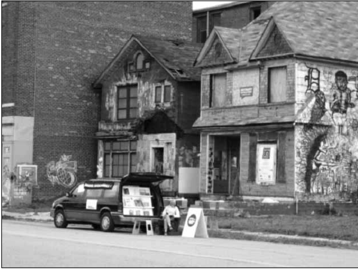
Figure 3 – Lee Rodney. Border Bookmobile , c. 2010 (in Detroit)