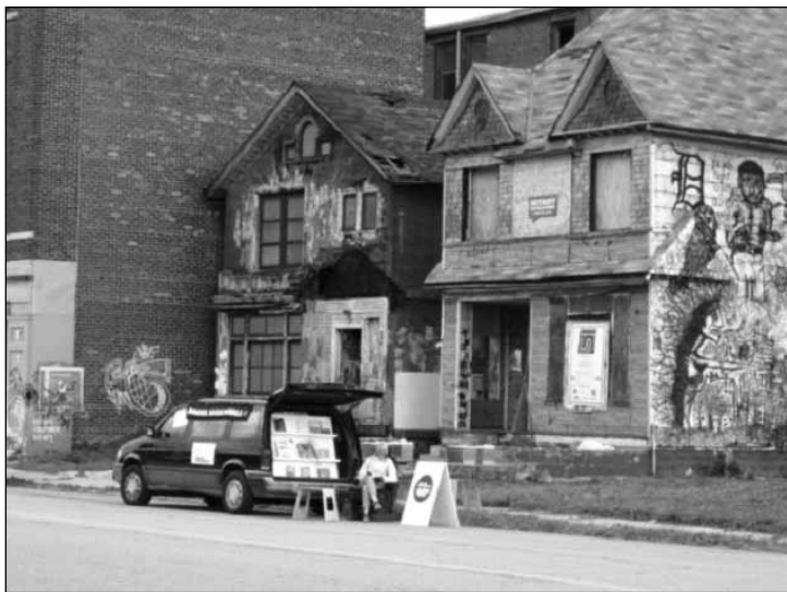
Figure 3 – Lee Rodney. Border Bookmobile , c. 2010 (in Detroit)