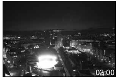
Figures 1 and 2 – Potsdamer Platz during the night of Tuesday, July 1, 2014 at 23h and at 3h

The diverse category of urban functions was subdivided into four categories: retail, gastronomy, offices/services, and culture/leisure. Similarly, the light sources were classified according to the functions they fulfill: infrastructural, architectural, advertisement and indoor lighting. As a comparative basis, the on-ratio relative to each category's potential maximum was calculated in hourly intervals for the time between 20-6h (see Figure 3, which shows two-hours intervals).