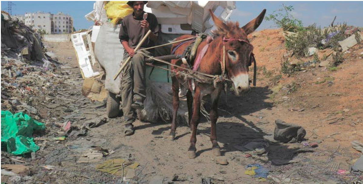
A bouar returning from his tour in the outskirts of Casablanca. (Photo Pascal Garret, May 2016)

This bouar (the word is derived from the French word éboueur for garbage man) returns from the city with a cart filled with his daily collection. But the increasing number of containers buried in the affluent neighbourhoods of Casablanca reduces access to this waste resource.