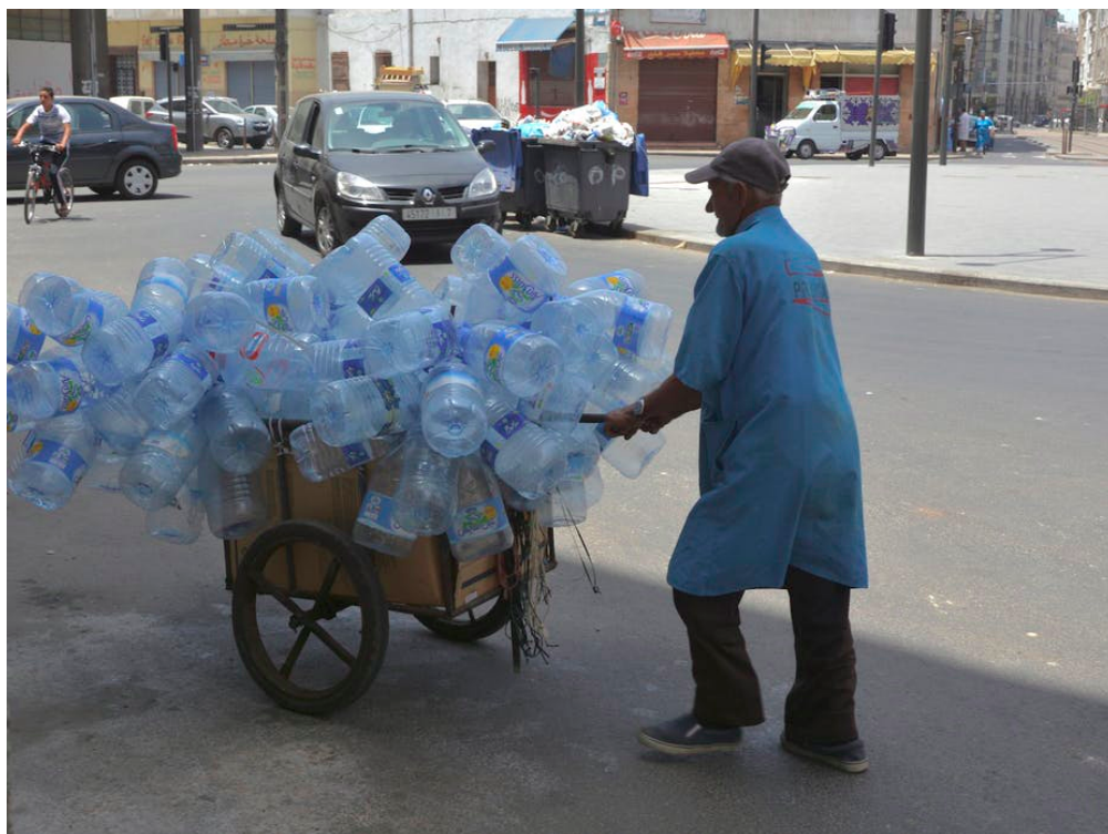
A wastepicker working in the streets of Casablanca.