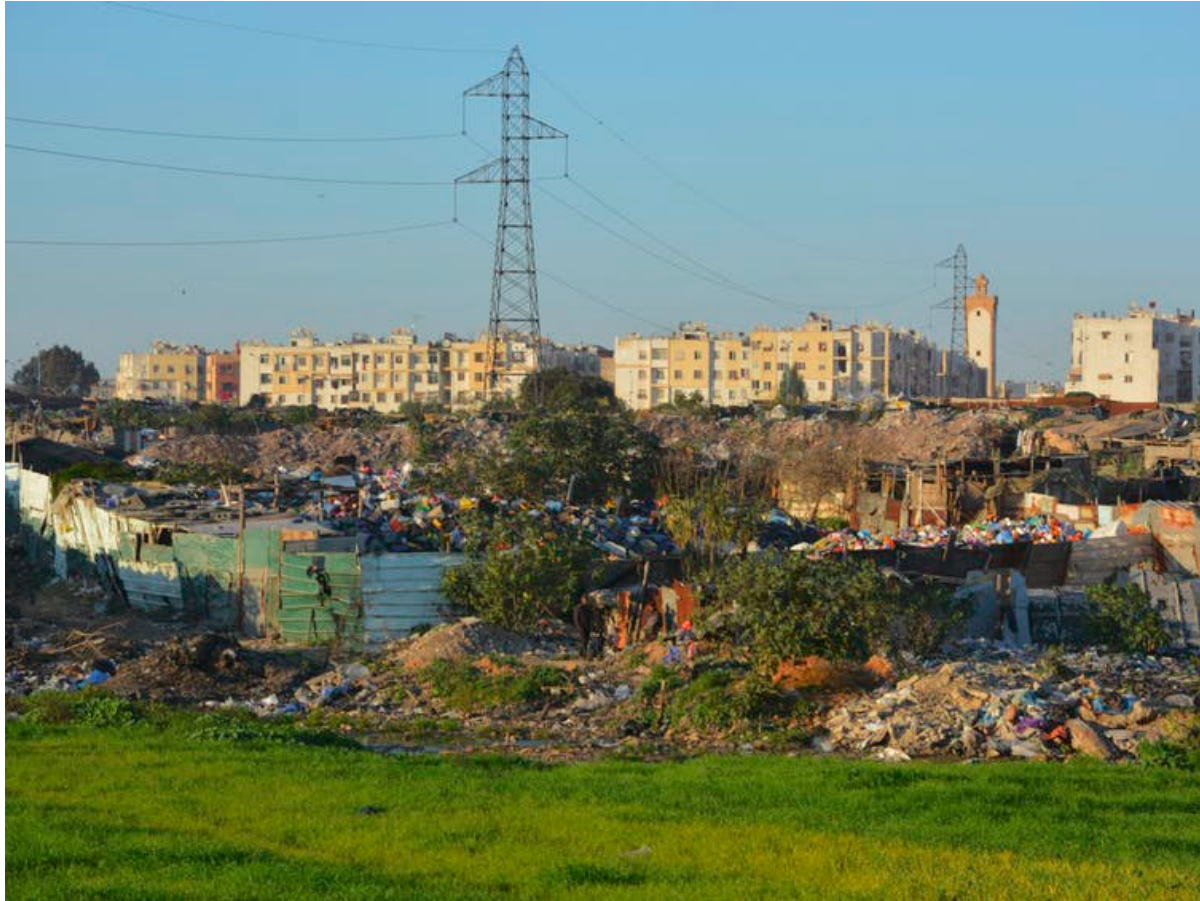
Overview of one part of a waste recycling area in Casablanca, Lahraouine. In the background, you can see the social housing district of Attacharouk.

Far from presenting an image of misery and exclusion, we wish to portray this population free from the stigma that usually accompanies activities linked to waste.