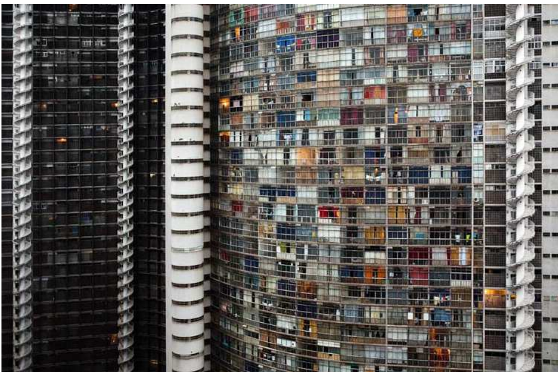
Photo 7 Building in São Paulo's center