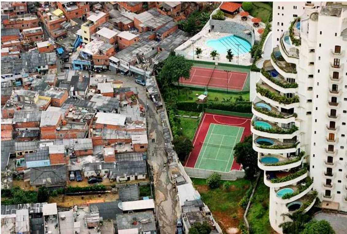
Photo 1 Inequality