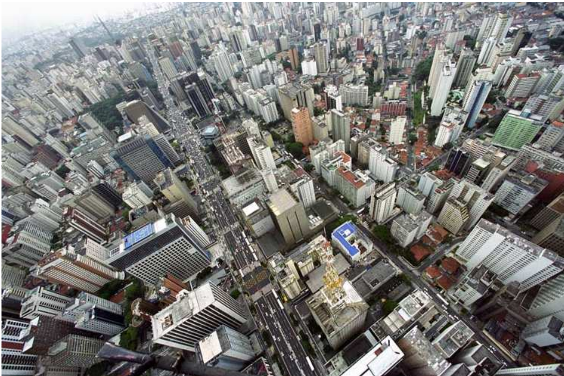
Photo 6 Avenida Paulista, in São Paulo's center