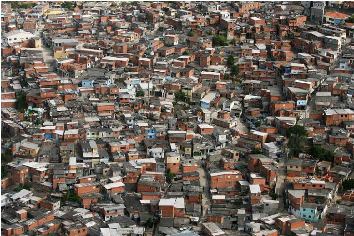
Photo 5 Favela in São Paulo