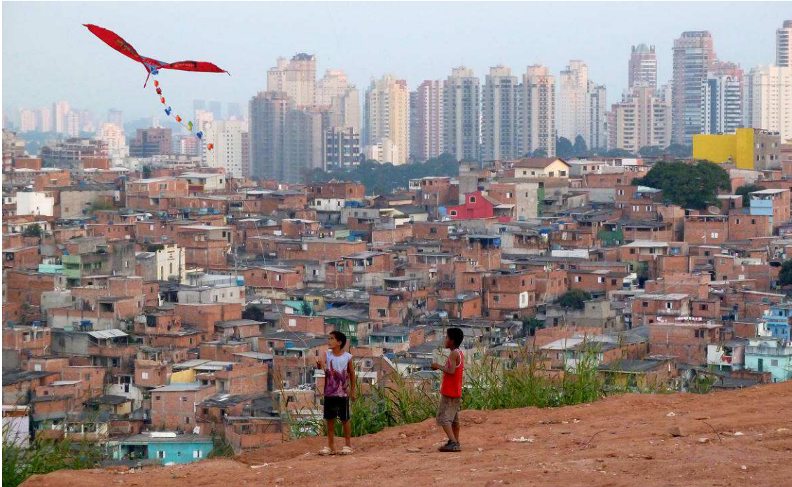
Photo 4 Children of Paraisópolis

Cairo (Egypt), Manilla (Philippines), Mumbai (India), Rio de Janeiro (Brazil), La Paz (Bolivia), from Chile, Île-de-France and Ghana.