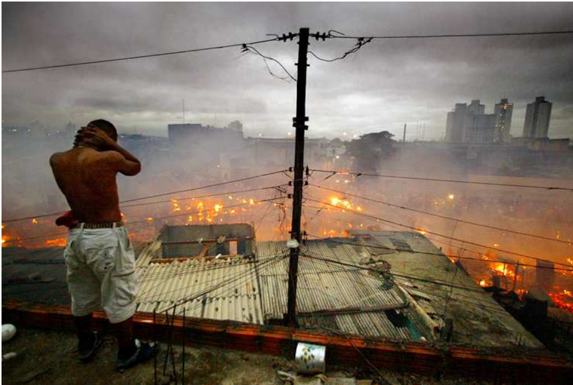
Photo 8 Fire destroying a favela in São Paulo