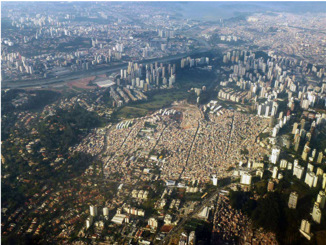
Photo 2 Paraisópolis