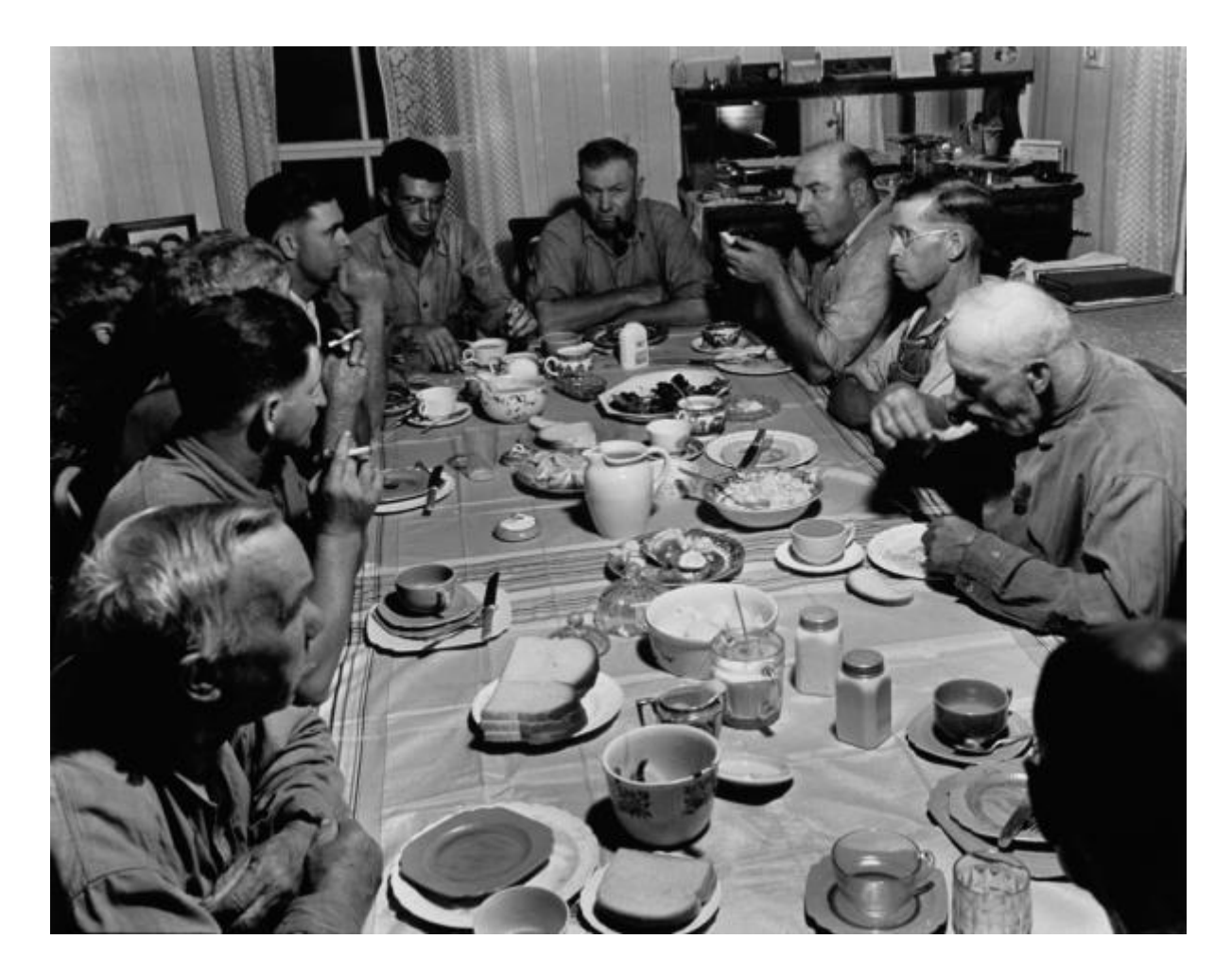
Image 1 - Farmers around a table eating

Like most of these photos, it is beautifully made. He appears to have shot at f 16 on his square format Rolleiflex (80 mm lens, not very wide!). He used a flash, positioned to the side, and this allowed him to use the small aperture and to get depth of field sufficient to read the details of the room and the people. The farmers are carrying on as though he's not there. He's positioned himself above and behind the table, probably standing on a chair, and yet he's being completely ignored. When farmers saw this photo their reactions were vivid. Not just remembering what they had done on many changing works crews, but what it had meant. I based the book around these conversations, relating how the farmers remembered the past to the structural changes they were experiencing.