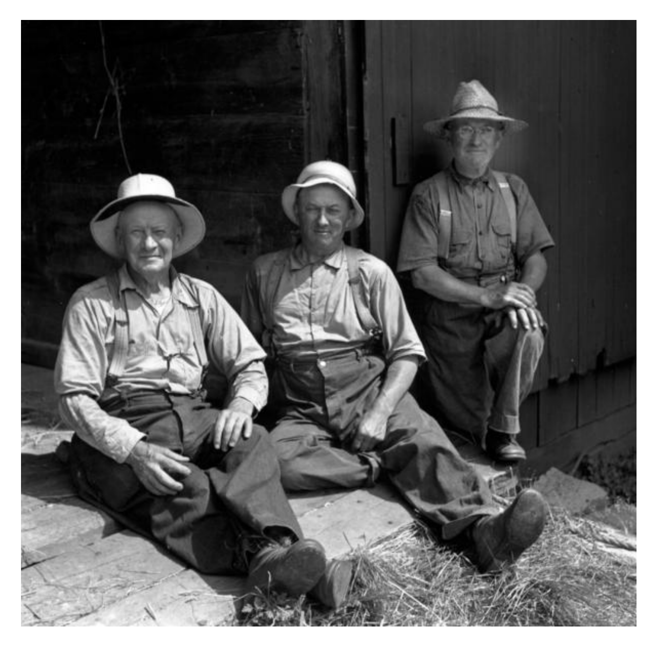
Image 2 - Farmers

The photo (Image 2) also records a momentary interaction. Gordon Parks was probably the first African American they had met. He is likely wearing a suit; he is a professional. He's shooting with a Rolleiflex, an impressive piece of equipment. But they don't seem to be looking at him out of curiosity; the photo seems to briefly interrupt a moment of normality. So the photo documents the farmers, beautifully framed in the square format of the Rolleiflex, but it also documents a moment that likely never happened before: an African American professional, standing above and photographing farmers relaxed in their poses. I'd like to read the photo to mean that rural northern people escaped the virulent racism of the era (at least in the South) but that would be a reach, of course. Still, they are cooperating.