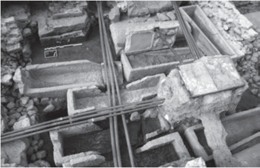
Figure 5.4. Luxeuil, Place de la République, sarcophagi in the funeral enclosure/mausoleum.

1715, 31 but it was demolished at the end of the eighteenth century and the site levelled to form a town square. The earliest remains revealed by the excavation relate to a Gallo-Roman house which developed through four phases between the middle of the first and the middle of the fourth century AD. The Gallo-Roman remains are particularly well preserved, in spite of the later construction of the church. The floors of the internal living area, the fireplaces located in the walls, the ground level of exterior courtyards, the wells and a hydraulic system, and even the walls of adjoining buildings are all clearly visible. This building, which formed part of a peripheral quarter of the town, was abandoned c. AD 350. In the ruins of these structures a burial ground developed, starting from the middle of the fourth century according to radiocarbon analysis.