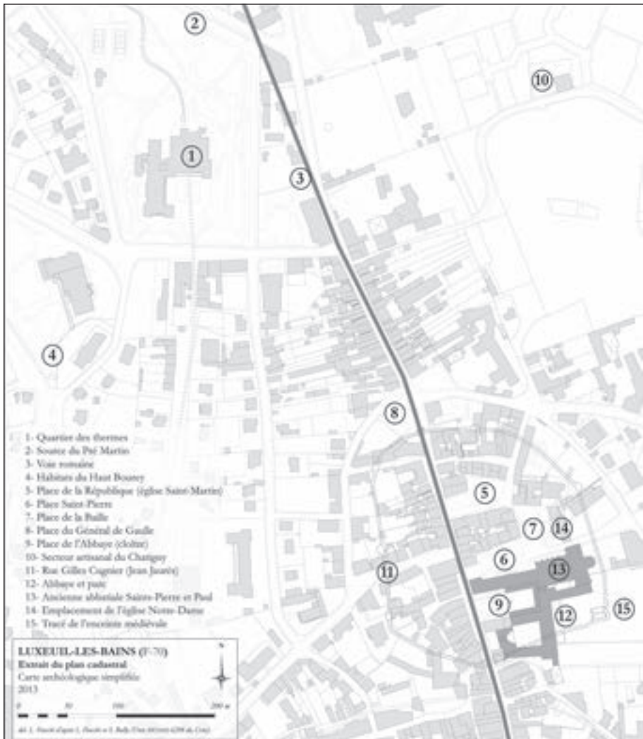
Figure 5.3. Plan of the town of Luxeuil. L. Fiocchi, from Bully and others, 'Les Origines du monastère de Luxeuil', p. 313.

As in the case of Annegray, the words eremus and saltus are used, and the wolves are also present. The terms prisca tempora and uetusta tempora also evoke the image of a lost civilization, this time clearly identified as pagan, with the practice of horrid and unholy rites. Jonas does not say that pagans were still living there when Columbanus came, but the mention of pagan practice is intentional and implies a missionary twist to the installation of the Irish in Luxeuil, pos-