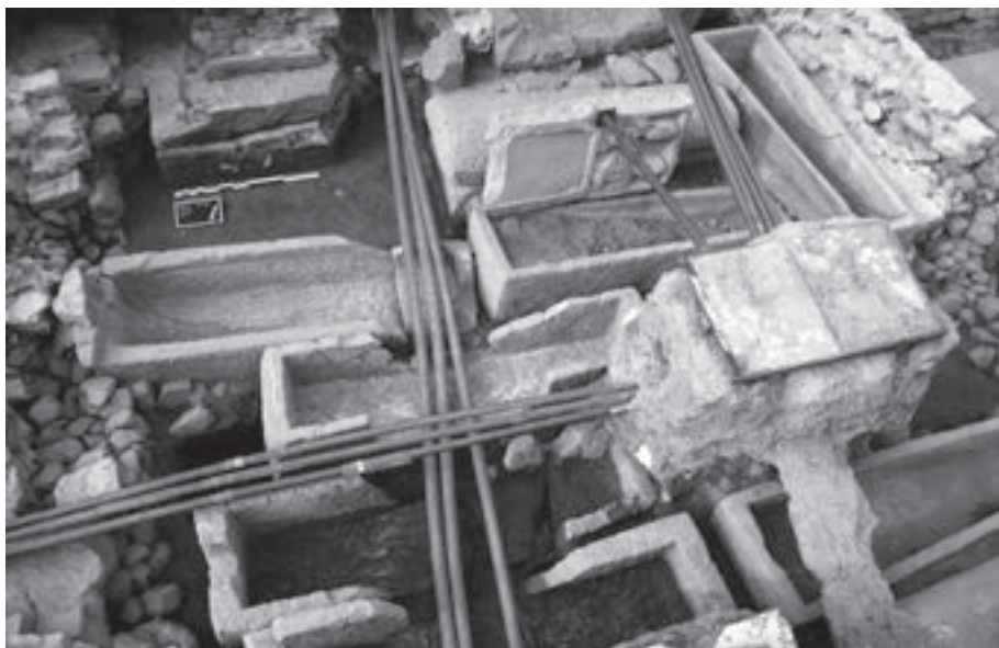
Figure 5.4. Luxeuil, Place de la République, sarcophagi in the funeral enclosure/mausoleum.

1715, 31 but it was demolished at the end of the eighteenth century and the site levelled to form a town square. The earliest remains revealed by the excavation relate to a Gallo-Roman house which developed through four phases between the middle of the first and the middle of the fourth century AD. The Gallo-Roman remains are particularly well preserved, in spite of the later construction of the church. The floors of the internal living area, the fireplaces located in the walls, the ground level of exterior courtyards, the wells and a hydraulic system, and even the walls of adjoining buildings are all clearly visible. This building, which formed part of a peripheral quarter of the town, was abandoned c. AD 350. In the ruins of these structures a burial ground developed, starting from the middle of the fourth century according to radiocarbon analysis.