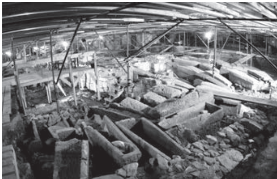
Figure 5.5. Luxeuil, Place de la République, general view over the cemetery behind the crypt of Saint-Martin.

bon dated to the early years of the fifth century. 32 The cover of another sarcophagus consisted of a re-used funeral stele placed face downwards, the exterior of which had been carved with a large cross. It may be one of the first indications of an early Christian community in Luxeuil.