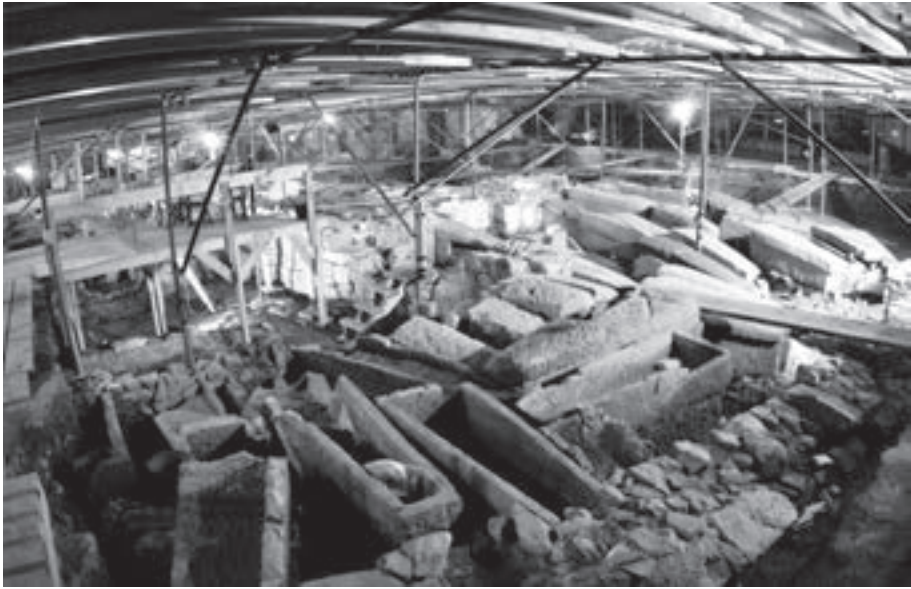
Figure 5.5. Luxeuil, Place de la République, general view over the cemetery behind the crypt of Saint-Martin.

bon dated to the early years of the fifth century. 32 The cover of another sarcophagus consisted of a re-used funeral stele placed face downwards, the exterior of which had been carved with a large cross. It may be one of the first indications of an early Christian community in Luxeuil.