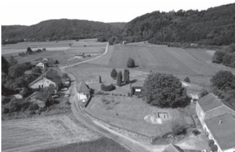
Figure 5.2. General view of Annegray from the south. The Romanesque church and the Merovingian sarcophagi are located on the small mound in the foreground. In the background, one can see the Church of Saint-Martin on top of the hill and just below, to the left, the gap leading to the Moselle Valley. The fortified medieval building is located behind the row of trees in the hollow between the Annegray mound and the hill of the Église Saint-Martin, on the right of the photograph.

The answer to this question may lie in Mont Saint-Martin, the hill which dominates the site of Annegray, just 700 metres north of the ecclesiastical site. Nowadays, a thirteenth-century church occupies the top of the hill. However, a number of discoveries made on the site since the eighteenth century point to the presence of a Gallo-Roman sanctuary on the same site. This has been argued to have been a temple dedicated to Diana, on the evidence of a stele representing the goddess with a crescent moon above her head and a statuette of her as a huntress, both discovered at the site. 18 A number of ex-voto offerings were also discovered in the nave of the church itself, while tiles and pottery (dated to the first and second century AD) found in the cemetery around the church testify to Gallo-Roman occupation of the site, most probably cultic in nature. The early Christianization of the mountain is suggested by the presence