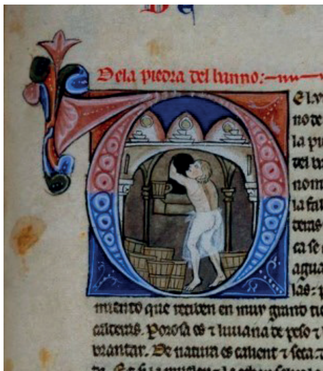
Lapidario , MSS (h-I-15). Monasterio del Escorial, fol. 69.r.

A pesar de las prohibiciones y críticas a su uso, existen baños en la España cristiana, bien construidos ex novo o bien reutilizando los pequeños balnea de periodos previos. En la España cristiana entre el siglo X y el XIII, no solo se reutilizaron los baños andalusíes existentes antes de la dominación castellana, sino que también se construyeron baños ex novo en las distintas ciudades. Se trataba de instalaciones mas humildes que los baños islámicos, aunque con cierta ascendencia de los mismos y con cierto componente nórdico con la existencia de cubetas, como muestra la imagen del Lapidario de Alfonso X. 61