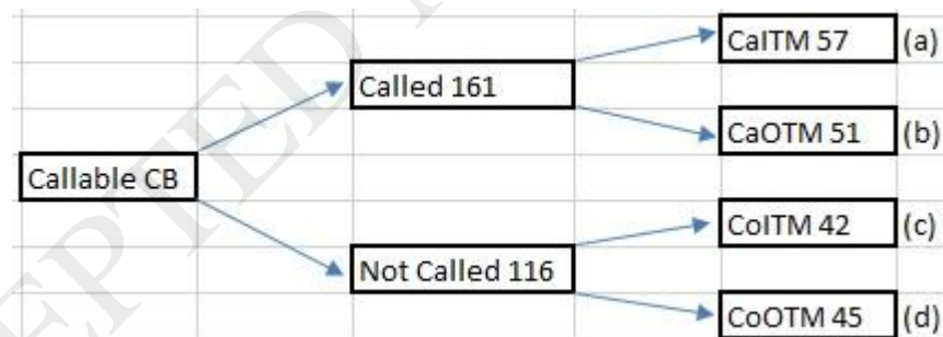
Diagram 2- Sample Structure

Tables 1 and 2 provide descriptive statistics on the various subsamples (Calling versus Non-calling, forced versus voluntary conversions, in-the-money call versus out-the-money call).