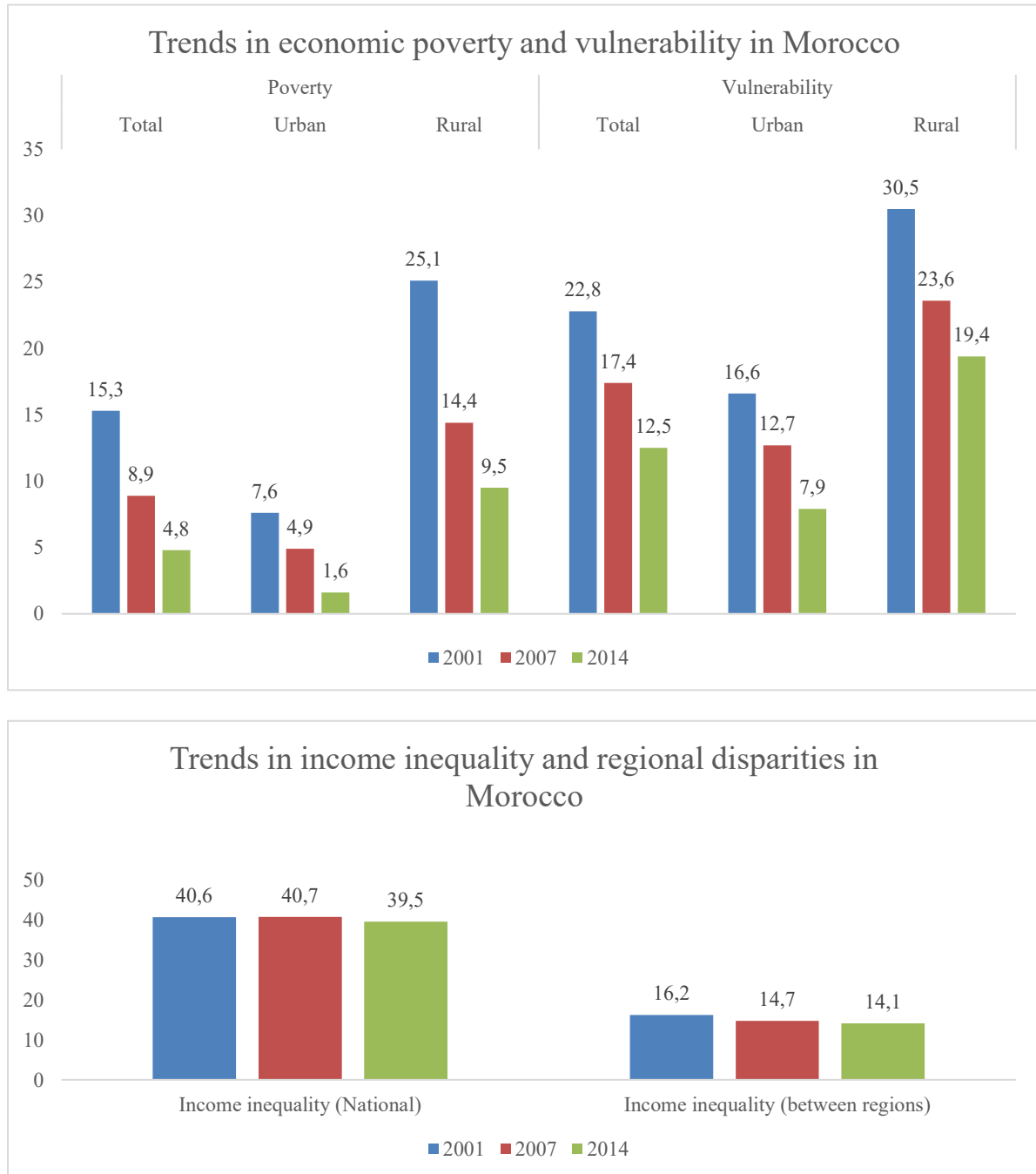
Figure 1: Evolution of poverty and vulnerability in Morocco