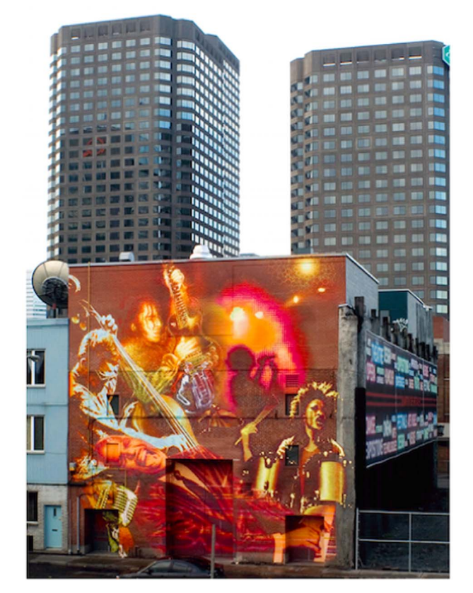
Fig. 3. An official mural in the QDS

Obviously, the design of some murals also participates in the creation of the desired cultural and artistic atmosphere. In the QDS, a jazz scene has been painted and covers an entire wall (Fig. 3), as a permanent reference to the International Jazz festival and the cultural life of the area. Realizing the beautifying potential of street art, the