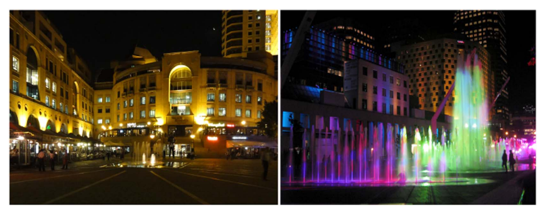
Fig. 1. The economic hub of Johannesburg and Montreal ... or vice versa?