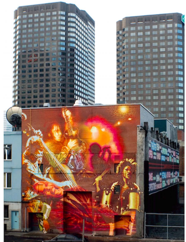
Fig. 3. An official mural in the QDS

Obviously, the design of some murals also participates in the creation of the desired cultural and artistic atmosphere. In the QDS, a jazz scene has been painted and covers an entire wall (Fig. 3), as a permanent reference to the International Jazz festival and the cultural life of the area. Realizing the beautifying potential of street art, the