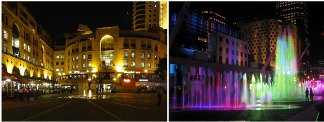
Fig. 1. The economic hub of Johannesburg and Montreal ... or vice versa? Source: Guinard, 2011 (left) and Montreal4you.com (right).