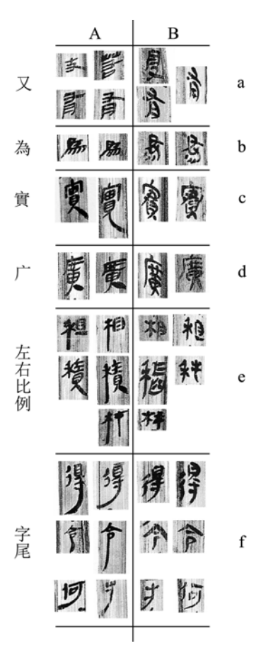
Fig. 2 Suan shu shu A-B 'finger-print' chains. Criteria: (a) 又 component, angle, square vs. round; (b) 為; (c) 實, final stroke and composition (毌 vs. 尹); (d) 廣, "feet" and component symmetry; (e) 木·禾 left-right component symmetry; (f) exaggerated end-stroke.

In short, fingerprinting relies on building chains of 'characteristic traits' 字迹特徵 that (1) consistent within a given writing sample and (2) consistently different with others under consideration. One first scours an individual text for appropriate candidates, as in fig. 2, then colour codes, in this case, each appearance of form A and B of characteristic a; then, as form A of a appears consistently on the same slip with, for example, form A of b, one extends the colour coding to the second characteristic, then, from there, to the third, fourth, fifth, and so on, until the entire manuscript is colour coded and the point(s) of transition between fingerprints stands out.