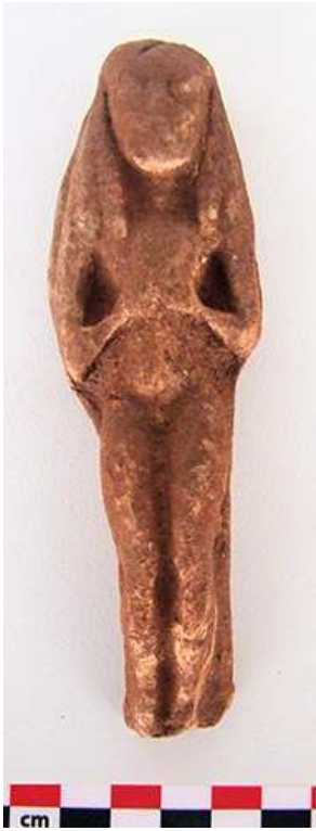
Fig. 3. Daedalic figurine from Deposit 1

abandoned in the beginning of the seventh century B.C.E. The location of the deposit, the context of the finds, and the finds themselves all may provisionally suggest a possible connection with Demeter and the Thesmophoria.