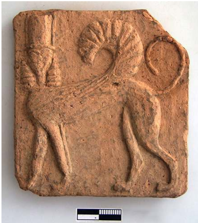
Fig. 5. DAEDALIC PLAQUE DEPICTING A SPHINX FROM DEPOSIT 1