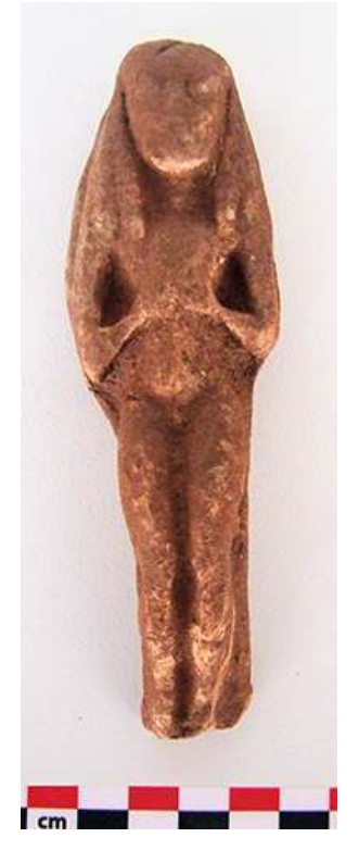
FIG. 4. HEAD OF A DAEDALIC PLAQUE FROM DEPOSIT 1

Fig. 3. Daedalic figurine from Deposit 1