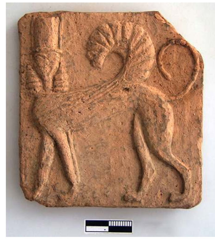
FIG. 5. DAEDALIC PLAQUE DEPICTING A SPHINX FROM DEPOSIT 1